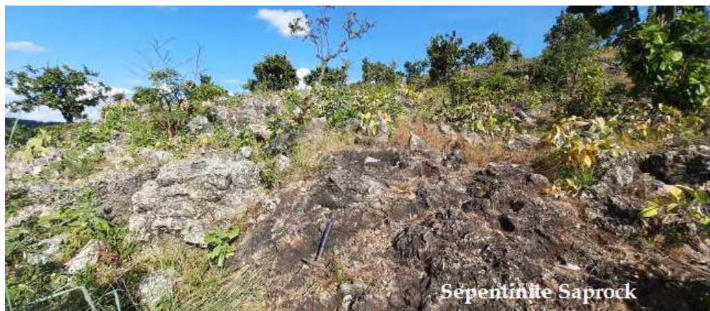
Figure 3: Serpentine Saprolitic Laterite

The mapping program identified additional laterite mineralization outside of the granted exploration tenements. RMI has subsequently filed a new application to cover the newly identified mineralized area. Figure 4 shows the mapped geology, newly applied license area along with the completed soil sampling locations.