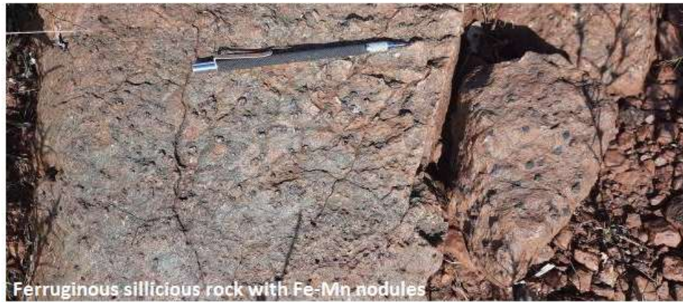
Figure 2: Ferruginous Siliceous Laterite