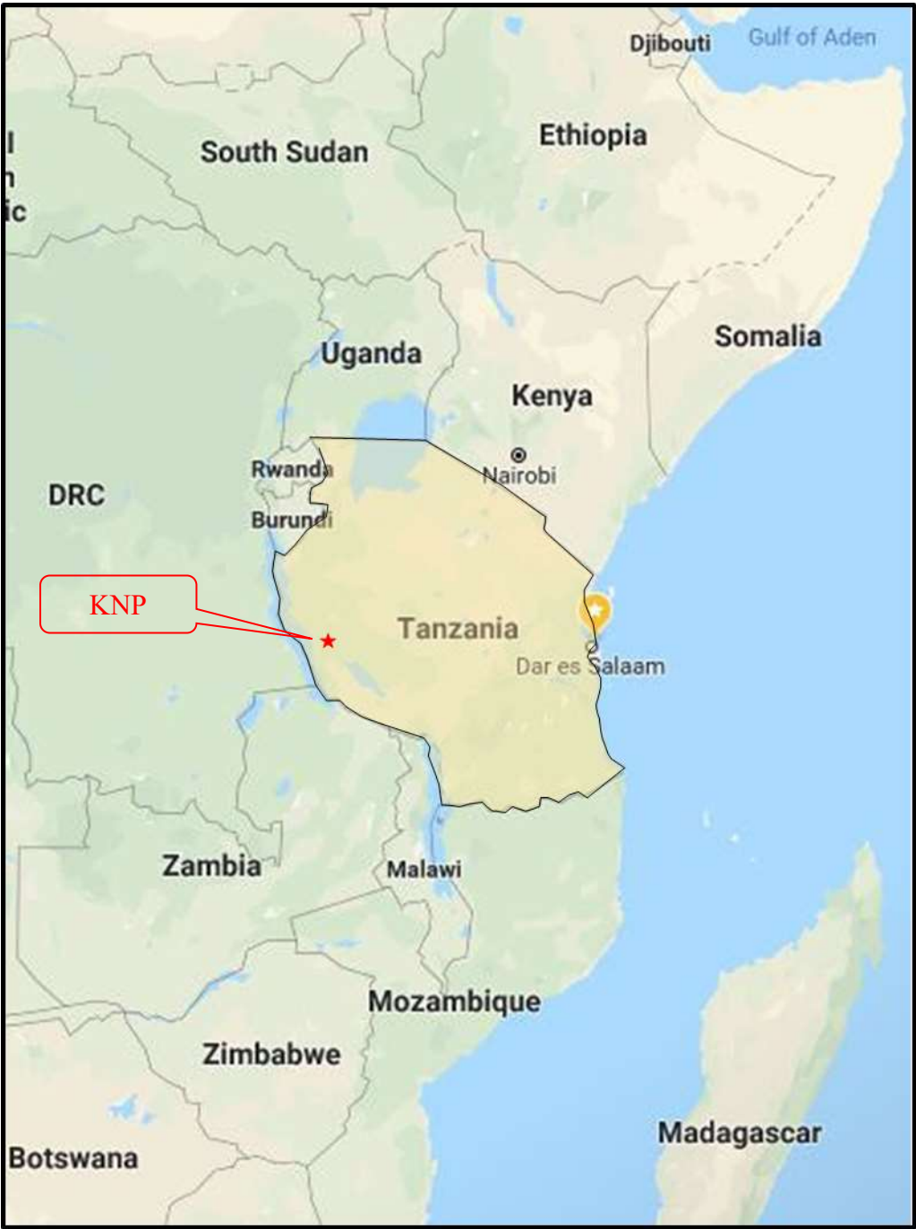
Figure 1 - Project location