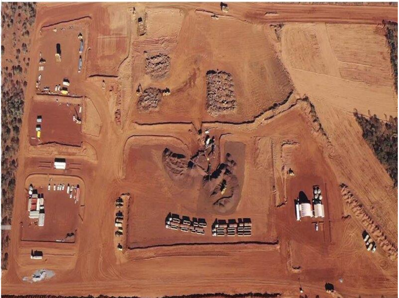
Figure 1: GWR's C4 deposit operations at Wiluna West in Western Australia.

The characteristics of the GWR product may also enable Macarthur to create a physical or virtual DSO blend product with Ularring DSO that achieves improved pricing going forward. Macarthur's iron ore at Ularring is contracted for sale to Glencore under an existing Offtake agreement entered into in 2019 (See link to TSXV announcement here ).