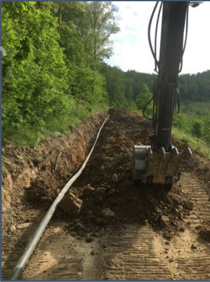
FIGURE 3: NEW 2-INCH PIPE BEING RUN AND CONNECTED