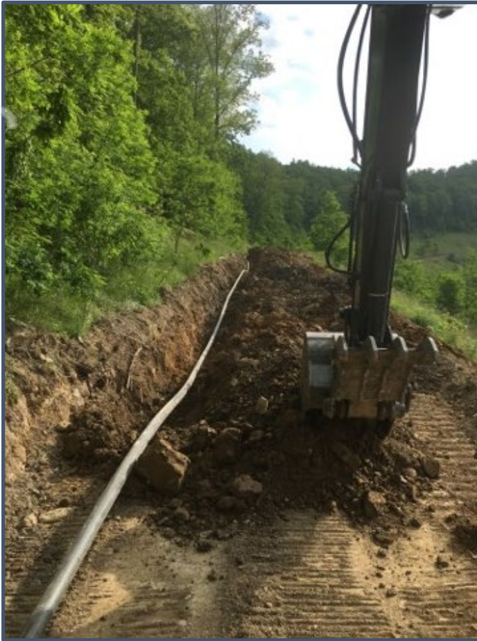
FIGURE 3: NEW 2-INCH PIPE BEING RUN AND CONNECTED