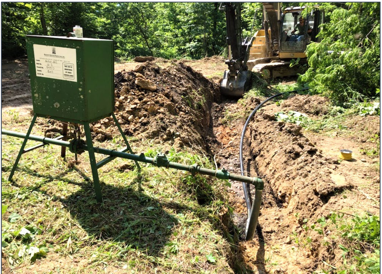
FIGURE 2: PREVIOUSLY OFFLINE GAS WELL BEING TIED BACK INTO NEWLY LAID PIPELINE