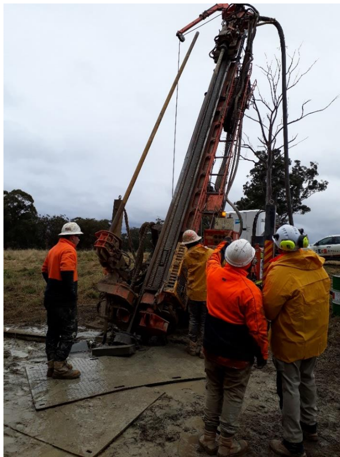
Figure 3: Drilling at the Enmore Gold Project