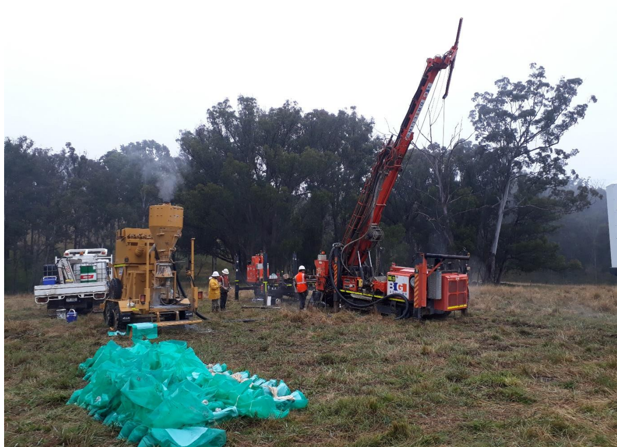
Figure 2: Drilling continues at the Enmore Gold Project

After completing the Sunnyside East holes, Okapi will proceed to drill test the gold prospects of Sunnyside West (some 400m along strike from Sunnyside East) and, conditions permitting, two kilometres west of the Sunnyside prospects at Bora.