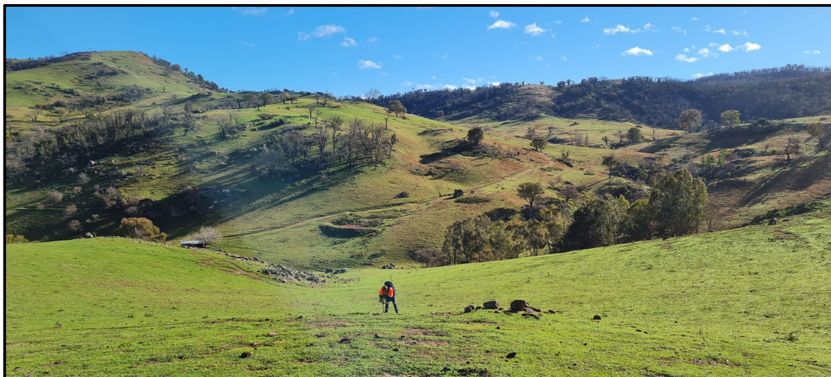
Figure 2: Soil Sampling at the Peep O'Day Gold Prospect, Yarara Project NSW.