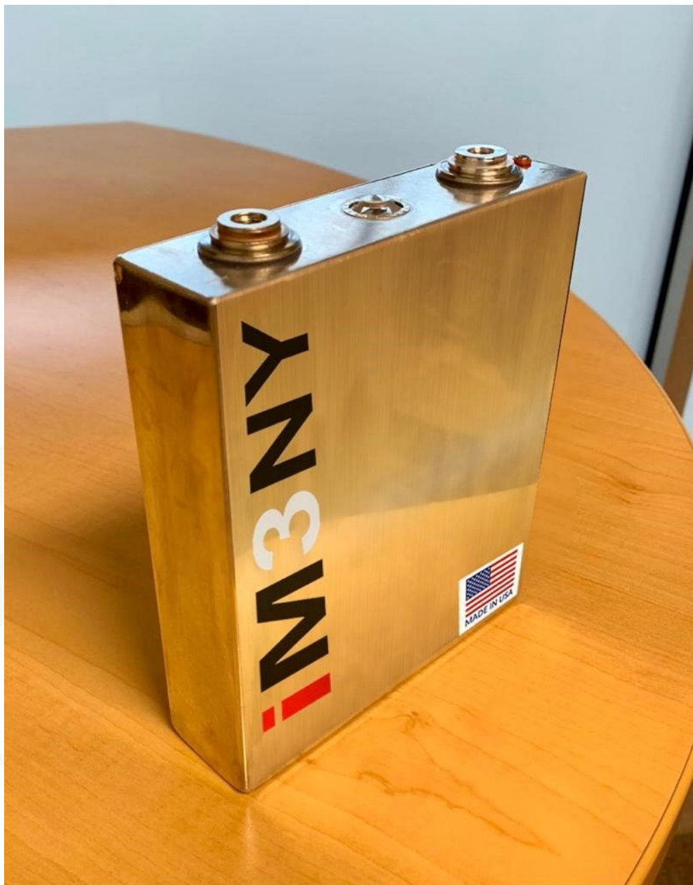
Figure 2: Full-sized Lithium-ion Battery Prismatic Cell produced by iM3NY

While the volumes would increase with fully optimised and automated lines, the current phase works towards production grade design and de-risks design unknowns involved in the transition from pilot production to full scale production.