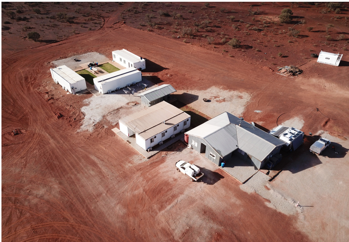
Figure 3: Tarmoola Exploration Camp (NW view)