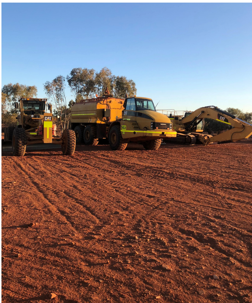
Figure 6: Carhill Contracting Earth moving equipment