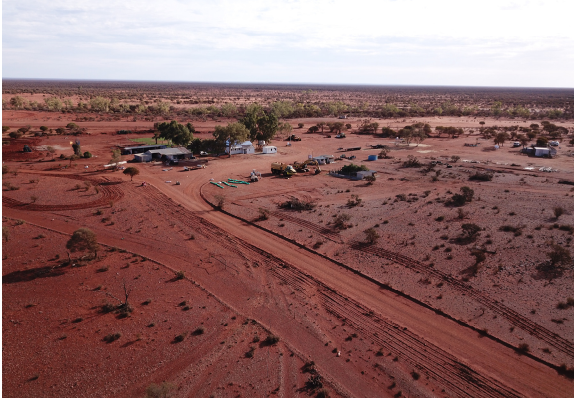
Figure 4: Tarmoola Station (SW view)