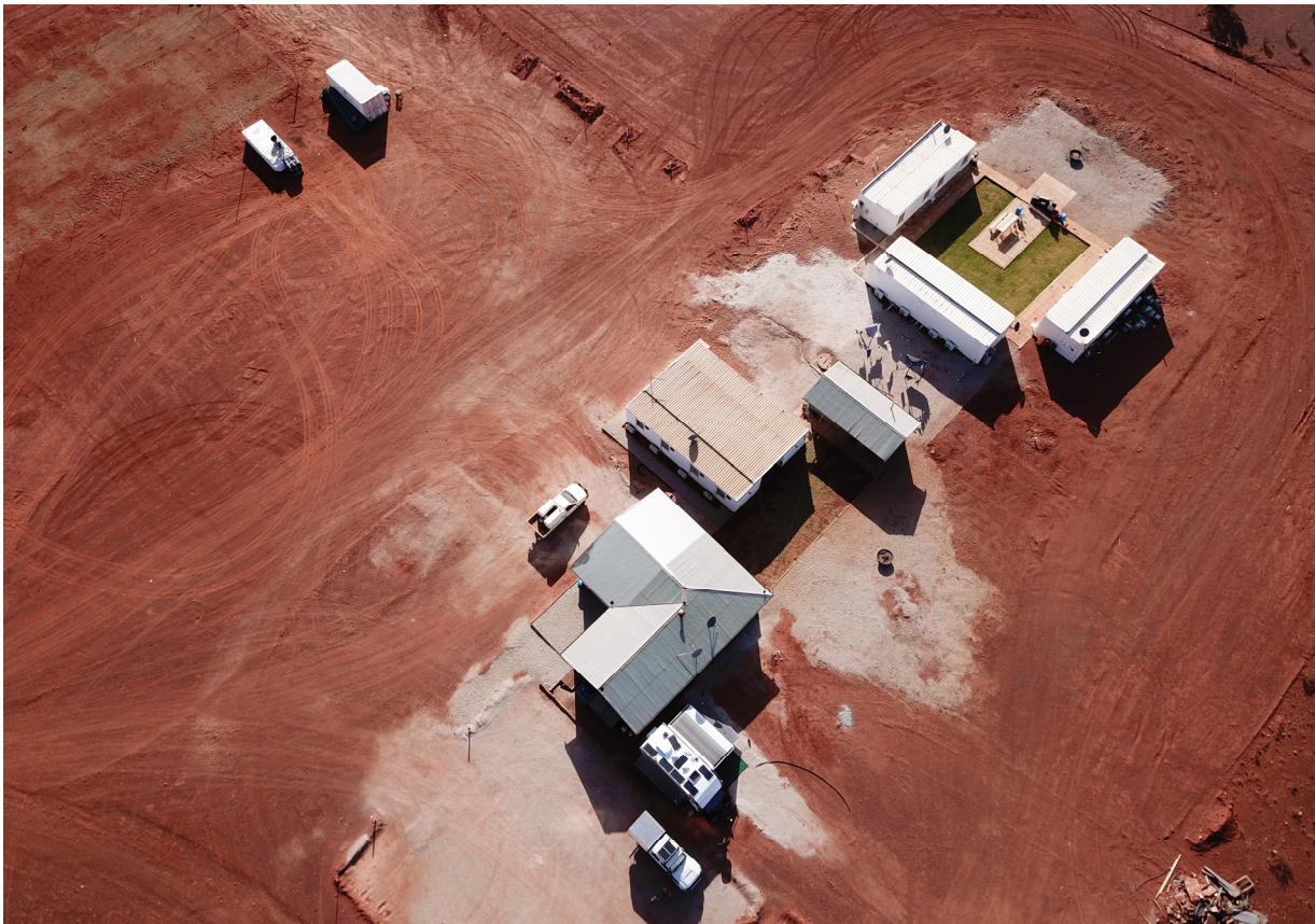
Figure 2: Tarmoola Exploration Camp