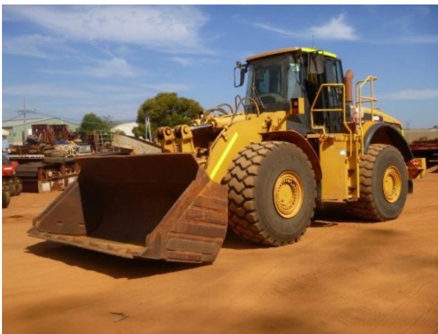
Figure 7: Carhill Contracting Earth moving equipment