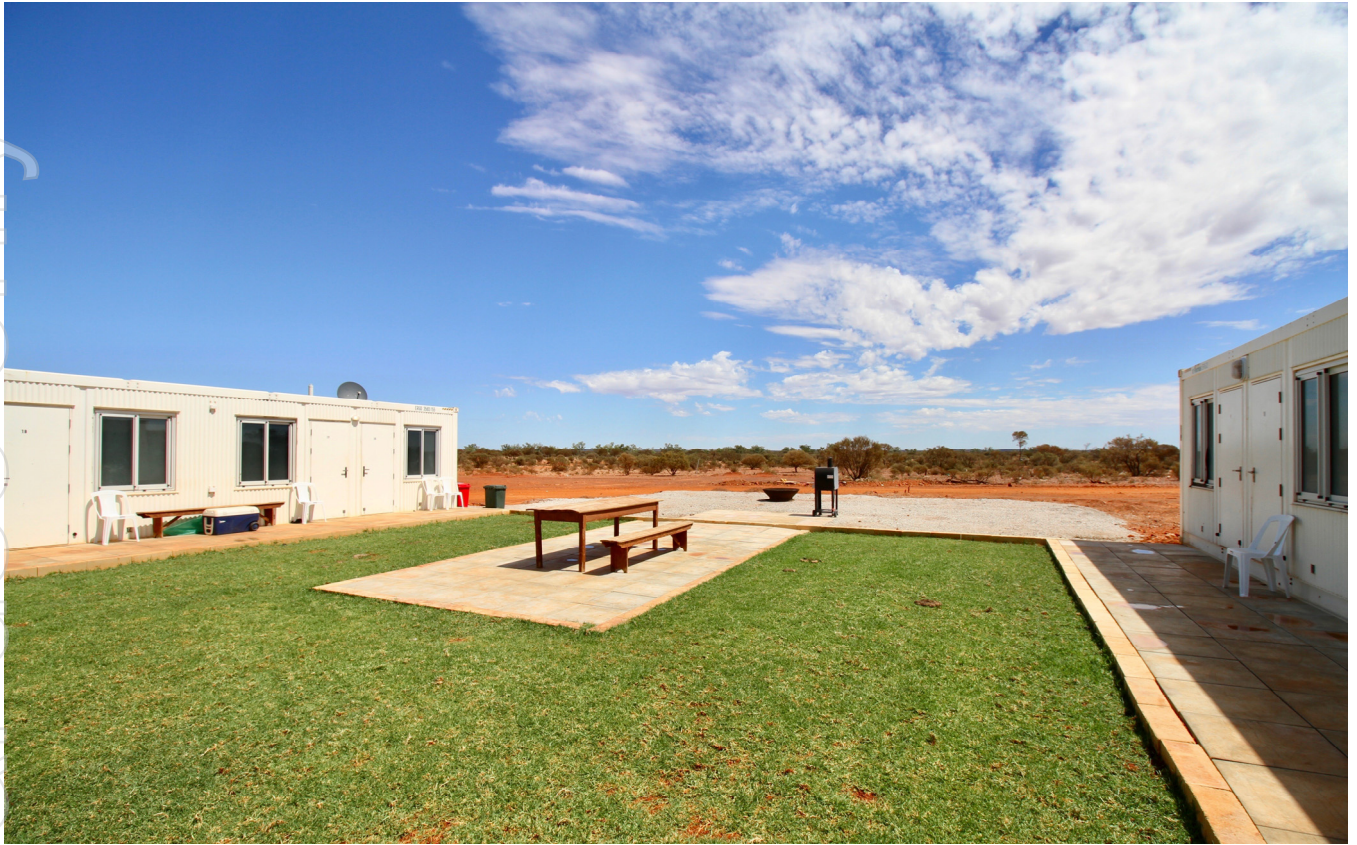
Figure 8: Tarmoola Exploration Camp

This announcement has been authorised for release by the Board.