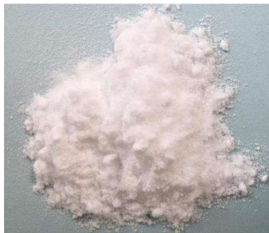
Figure 3: Novonix – Freshly assembled lithium-ion battery coin half-cell with Lake's lithium product: Hazen Research – Production of Lake's lithium carbonate product in lab in Colorado, USA..

Export credit offers a low cost and secure form of debt funding which will maximise value for shareholders and minimise risks to the Company.