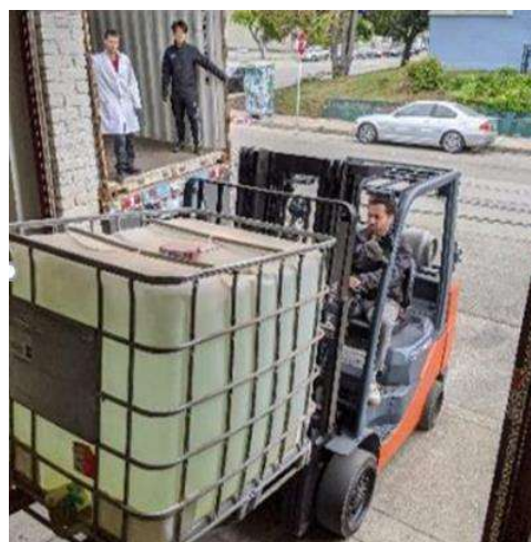
Figure 2: Lithium brines being pumped into containers at the Kachi Project. Containers delivered to Lilac in California.