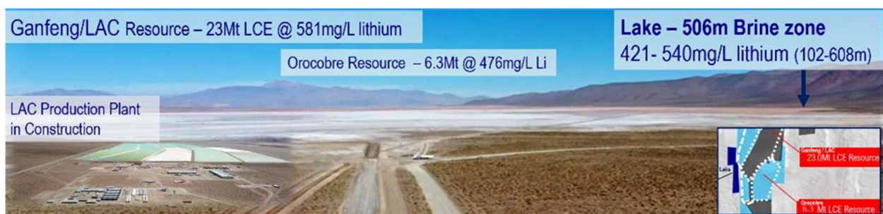
Figure 4: Cauchari – Location of Lake's Cauchari results in relation to the Ganfeng/ Lithium America's production development

This drilling confirmed similar grades and lithium brines extending into Lake's properties from the adjoining Ganfeng/Lithium Americas JV production development at Cauchari. The higher-grade results averaged 493 mg/L lithium over 343m (from 117m to 460m), up to 540 mg/L, with a Li/Mg ratio of 2.9.