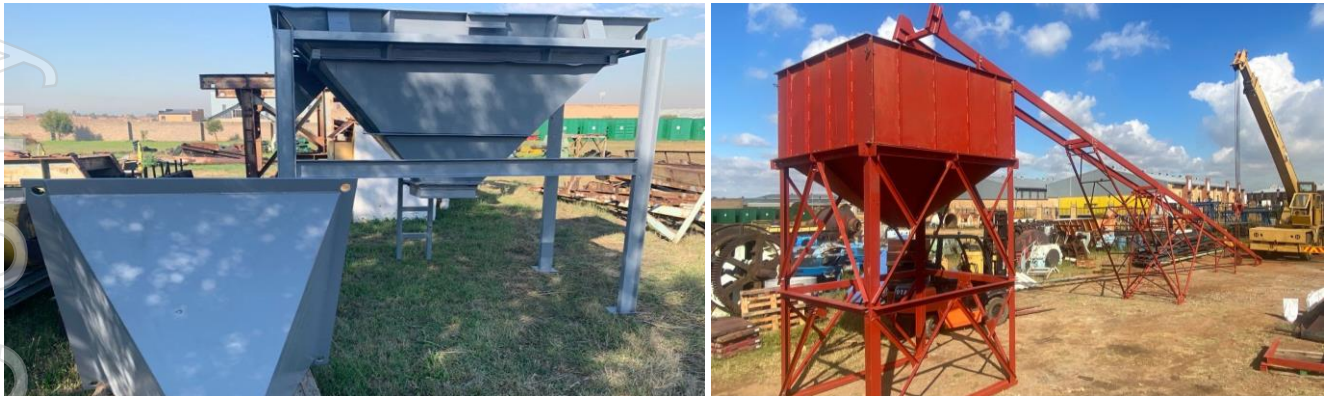
Figure 3 & 4 – Crusher Feed Hopper fully manufactured and DMS Feed Conveyor and Hopper Fabricated in South Africa

Further key upcoming milestones expected this quarter include: