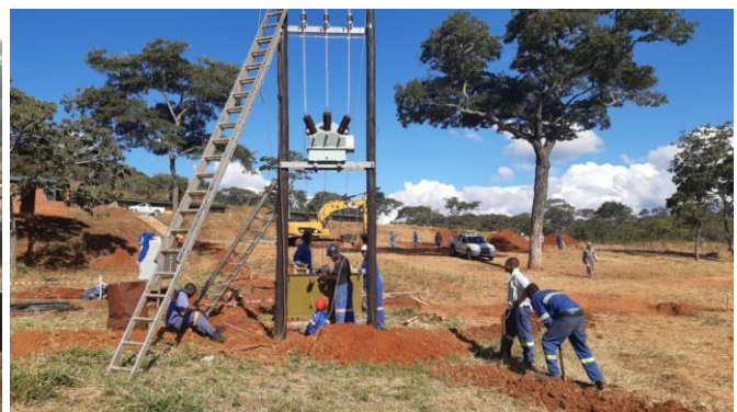
Figure 1 & 2 – Civil works for crushing plant and installation of power transformer