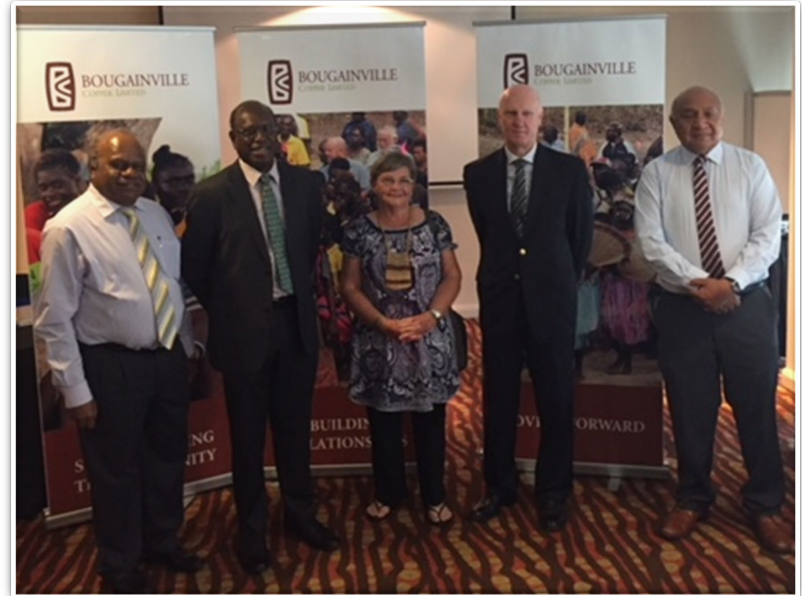
Board members at the 2018 Annual General Meeting

➤ Actively pursuing additional Bougainvillean appointments