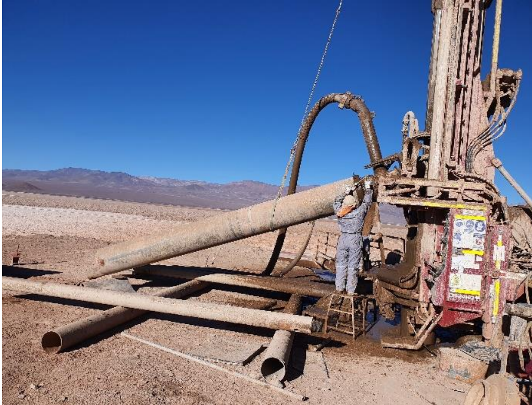
Figure 2 – Andinor construction of a 400m production well.

The kick-off meeting for the DFS update of the Stage One was conducted with Worley the first week of April. Several possible areas of improvement have been identified. Engineering work will focus initially on the re-sizing of the evaporation ponds where opportunities to reduce the capital expenditure related to this item have already been detected.