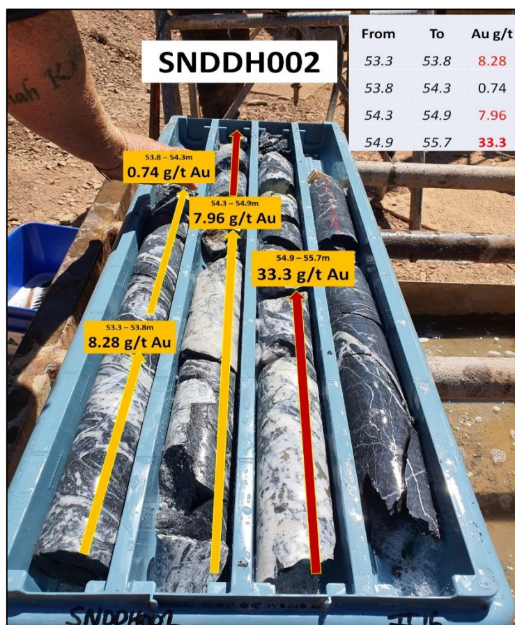
Figure 1: SNDDH002 diamond core with mineralised interval.

First Au Limited (“First Au” or “the Company”) today announces encouraging initial assay results from the Snowstorm EL5505 drilling project, with a well-mineralised zone intersected in the second hole SNDDH002 from 53.3m, with 3.1m @ 11.6 g/t Au , including 0.8m @ 33 g/t Au (see Figure 1).