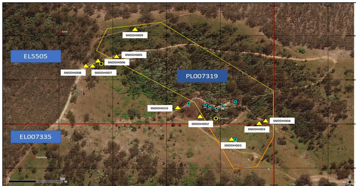
Figure 3: Drilling Collar Plan for EL5505 Snowstorm Project.

The drilling program is designed to test the steep south dipping mineralised trends as identified from surface mapping and rock chipping (see FAU ASX Announcement 1 st December 2020). The collar locations of the planned and drilled holes is illustrated in Figure 3.