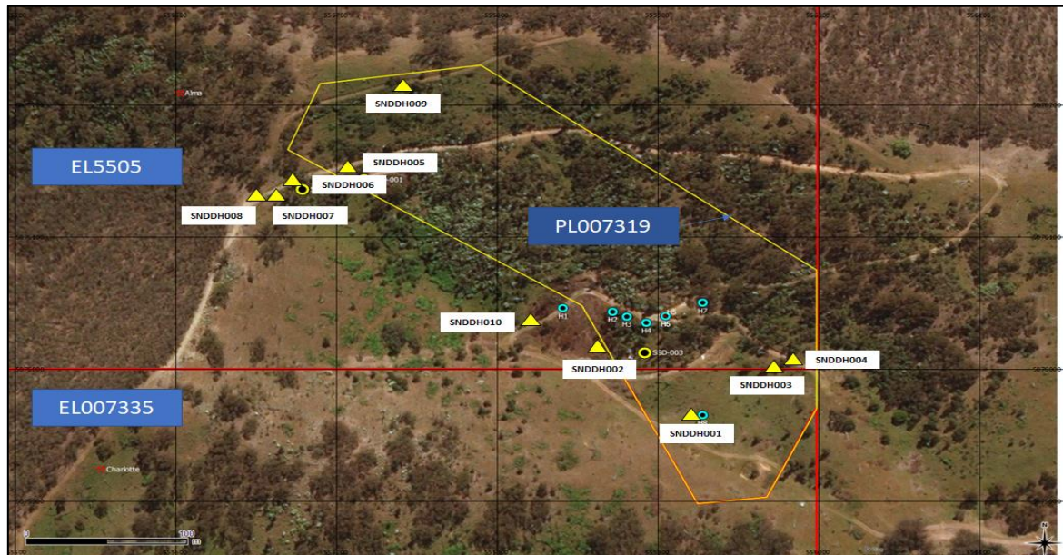
Figure 3: Drilling Collar Plan for EL5505 Snowstorm Project.

The drilling program is designed to test the steep south dipping mineralised trends as identified from surface mapping and rock chipping (see FAU ASX Announcement 1 st December 2020). The collar locations of the planned and drilled holes is illustrated in Figure 3.