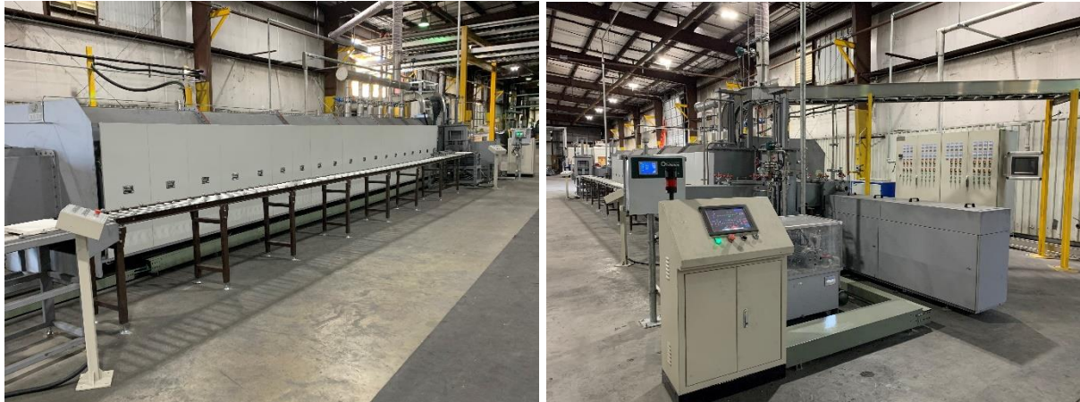
Figure 1: Main furnace chamber (left) and furnace control station (right) at Vidalia.

Syrah is progressing detailed design on the initial expansion of production capacity at Vidalia. A Final Investment Decision ("FID") for the construction of a 10ktpa AAM facility at Vidalia is planned during H2 2021, subject to end customer commitments and strategic / financial partnerships.