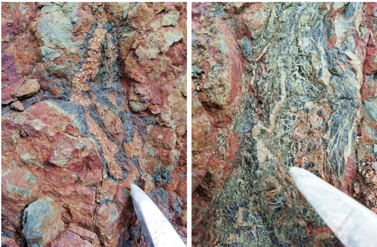
Figure 2: Example of stockwork mineralisation (chalcopyrite)

VMS deposits are one of the most researched deposit classes, and with their potential to form clusters of closely spaced deposits and their polymetallic ore, can be explored and brought into production with a relatively modest capital cost compared to larger but typically lower grade porphyry systems. Analogous mafic hosted VMS deposits occur in Cyprus (Troodos), Oman (Semail) and Turkey (Ergani) which have extensive zones or lenses of massive, semi-massive and disseminated sulphide mineralisation. The Cyprus deposit, for example, produced more than 1.3 million tonnes of Cu metal over its life from ore grading at 4.5% Cu average. These deposits also contain Se, Co and Ni.