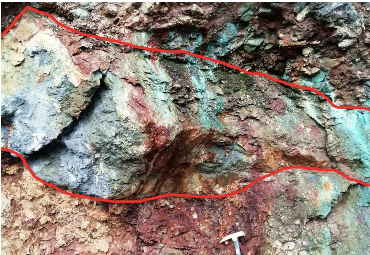
Figure 1: Outcropping massive sulphide lens (chalcopyrite & malachite)

Alta Zinc Limited (Alta or the Company) (ASX: AZI) is pleased to announce that it has lodged applications for two exploration licences (ELs) encompassing two of the most commercially significant copper mining districts in Italy. Examples of outcropping mineralisation at the Monte Bianco EL (Libiola site) are in Figures 1 and 2.