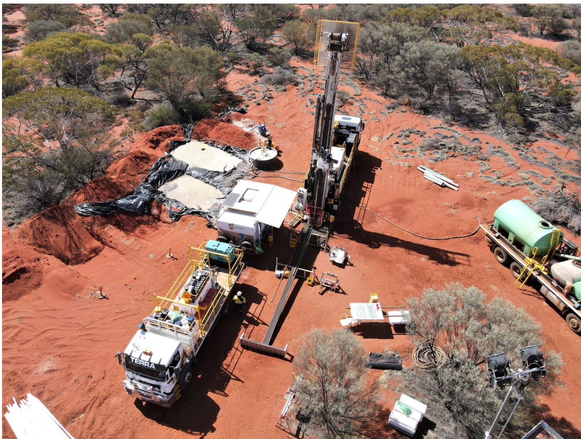
Figure 3 – diamond drilling underway at Mt Alexander.