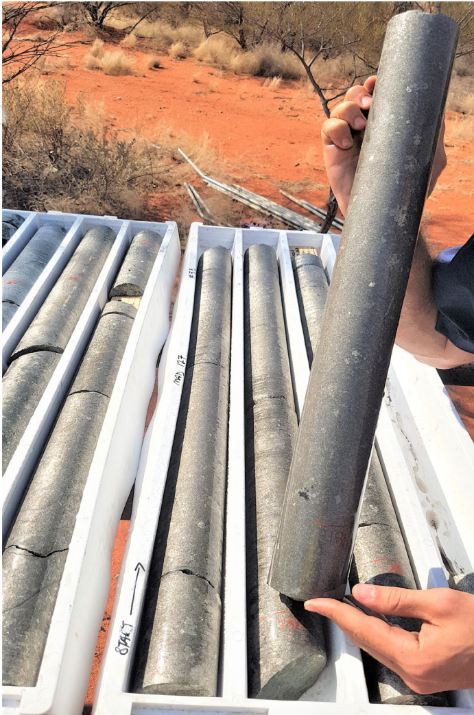
Figure 1 (left) – drill core from MAD127 at Investigators, one of multiple thick high-grade nickel-copper sulphide intersections already achieved at Investigators.

MAD127 returned assays of 8.49m @ 5.78% Ni, 2.64% Cu, 0.18% Co and 3.61g/t total PGEs from 183.9m.