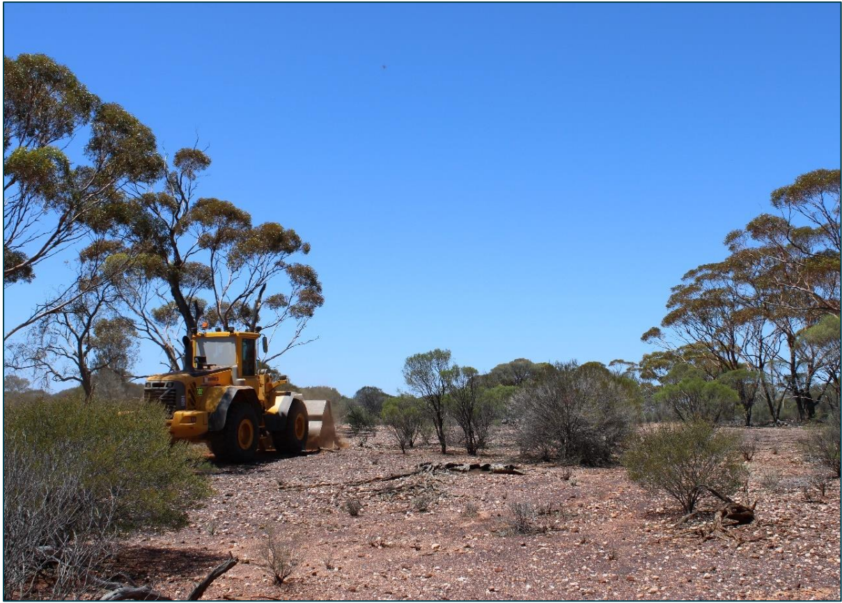
Figure 3: Loader clearing AC lines for drill rig access.