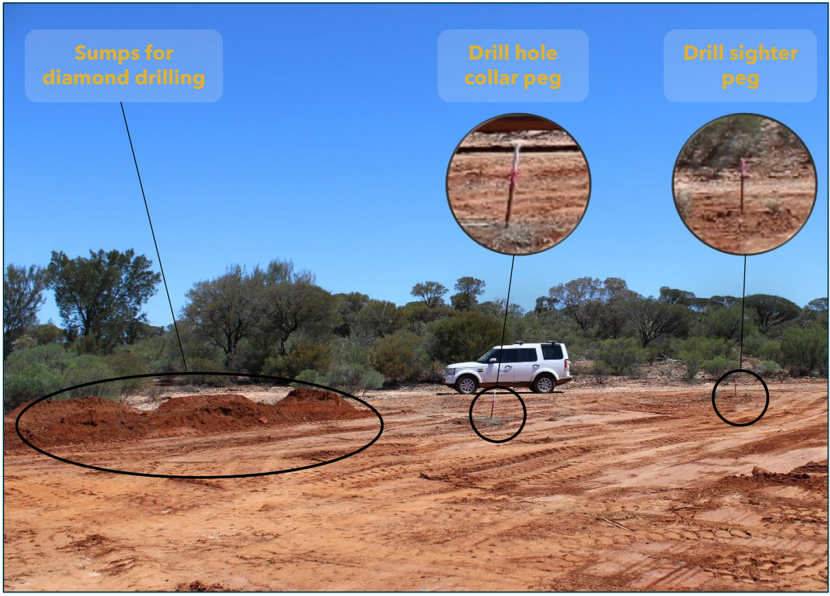
Figure 2: Drill pad for hole VDD011 cleared ready for drilling.