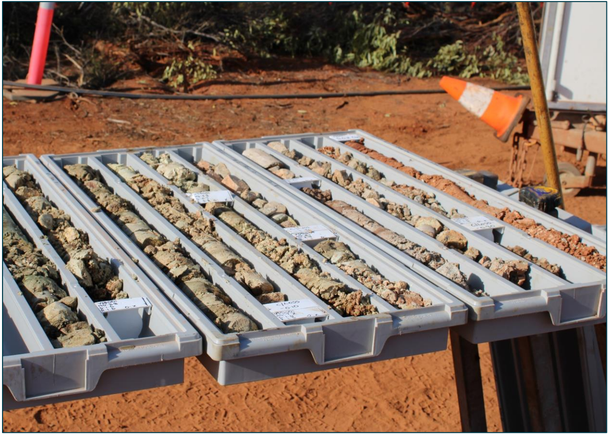
Figure 1: First 10m of diamond drill core from hole VDD001.