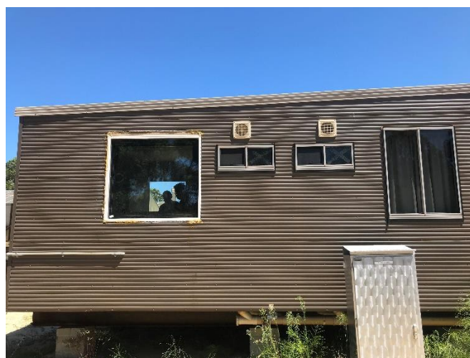
ATCO mining hut being retrofitted with ClearVue PV IGUs and Mirreco's Hemp panel insulation – view is through the installed IGU panels.