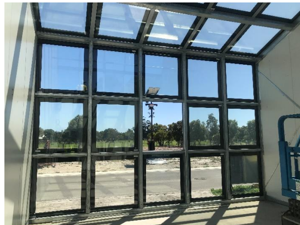
Views through the ClearVue PV IGUs at the greenhouse.