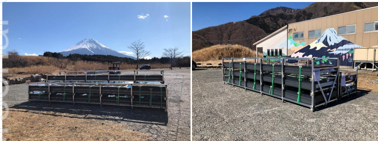
ClearVue PV IGU glazing units delivered to site at Fujisan Winery, Asagiri Plateau, base of Mt Fuji, Japan in anticipation of installation.

Further to the Company's Quarterly Update the Company is pleased to confirm that ClearVue's PV IGU glazing modules have now been delivered to site in Japan at the Fujisan Winery in the key tourist region of the Asagiri Plateau at the southwest base of Mt Fuji. Construction of the winery greenhouse and installation of the ClearVue PV IGUs into that structure is currently delayed primarily due to the COVID pandemic but is expected to commence in the coming months.