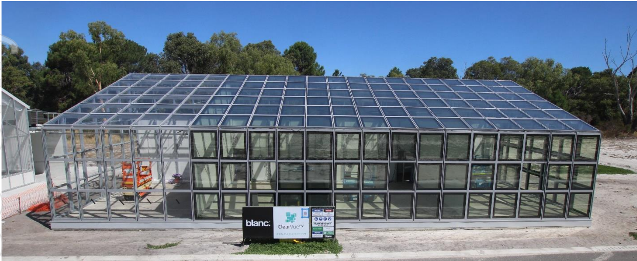
Three versions of ClearVue's PV glazing installed onto rooms 2,3 and 4 of ClearVue's solar greenhouse at Murdoch University, Western Australia. Room 1 – a trial 'control' room (far left) showing single pane glazing only.