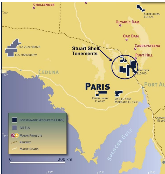
Figure 1: Investigator’s Stuart Shelf tenements

https://cdn-api.markitdigital.com/apiman-gateway/ASX/asx-research/1.0/file/2924-02344771-2A1282220?access_token=83ff96335c2d45a094df02a206a39ff4