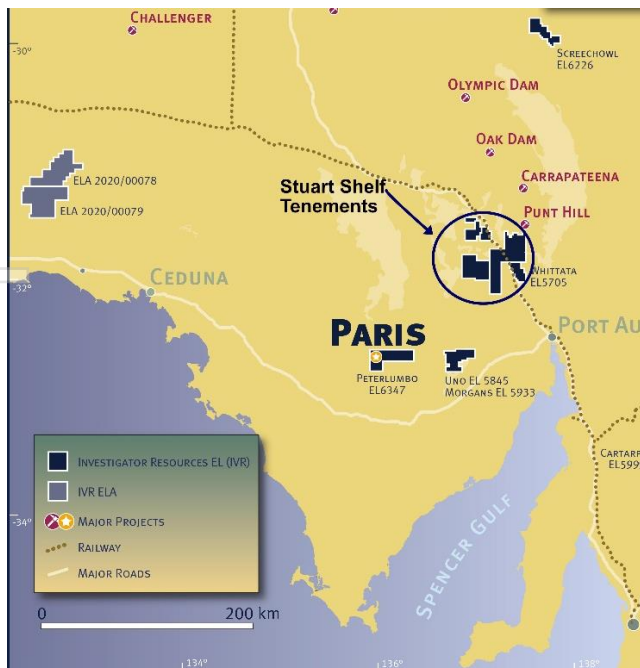
Figure 1: Investigator's Stuart Shelf tenements

https://cdn-api.markitdigital.com/apiman-gateway/ASX/asx-research/1.0/file/2924-02344771-2A1282220?access_token=83ff96335c2d45a094df02a206a39ff4