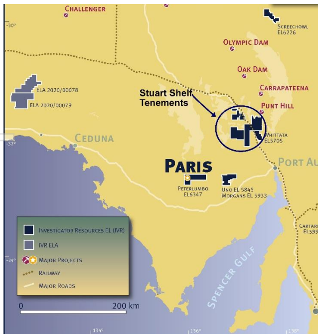
Figure 1: Investigator’s Stuart Shelf tenements

https://cdn-api.markitdigital.com/apiman-gateway/ASX/asx-research/1.0/file/2924-02344771-2A1282220?access_token=83ff96335c2d45a094df02a206a39ff4