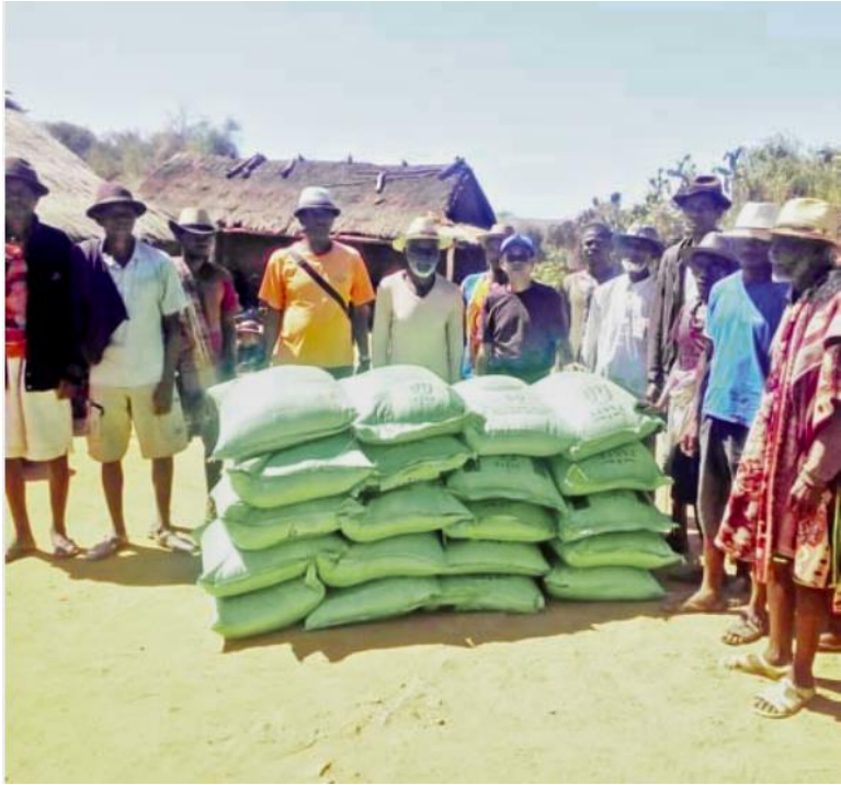
Some of the supplies donated by BlackEarth Minerals to local villages

This release has been authorised by the Company's Disclosure Committee