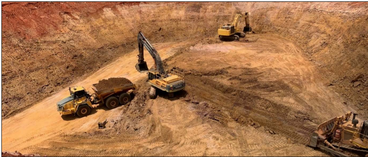
Figure 2: Dozer push sample collection