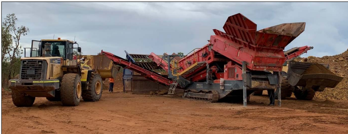
Figure 3: Screening to analyse variance in fraction size flitch

Access to site and accommodation was established to support the trial mining and other activities including a fire management program and general village maintenance was undertaken. Preparation and asset protection activities for the Kimberley wet season were carried out, with the accommodation village and site locked down at the conclusion of the trial mining program.