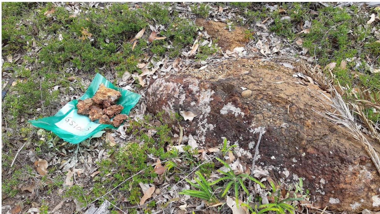
Figure 2 – Laterite sampling in LPI's Greenbushes tenement

The East Kirup Prospect is also associated with a north-west trending arsenic anomaly within laterite and soil. The prospect was originally defined by close spaced MMI sampling (50m apart on 100m lines) over the DB Shear Zone. Mapping has shown that rocks similar to those that host the main Greenbushes Pegmatite outcrop within the East Kirup Prospect. Limited historical drilling by Red River Resources on this tenement also defined the presence of these host rocks in the zone of lithium enrichment. To the east of the East Kirup Prospect is the Thomas A Prospect. This area contains historically mapped pegmatites which, on surface, are rich in kaolinite. The laterite sampling has shown that that the area has anomalous arsenic. Thirty four laterite samples will be taken in the areas covered in the Smith 1987 work to check the As values and to complete evaluation of the anomaly (sample sites shown in Figure 4).