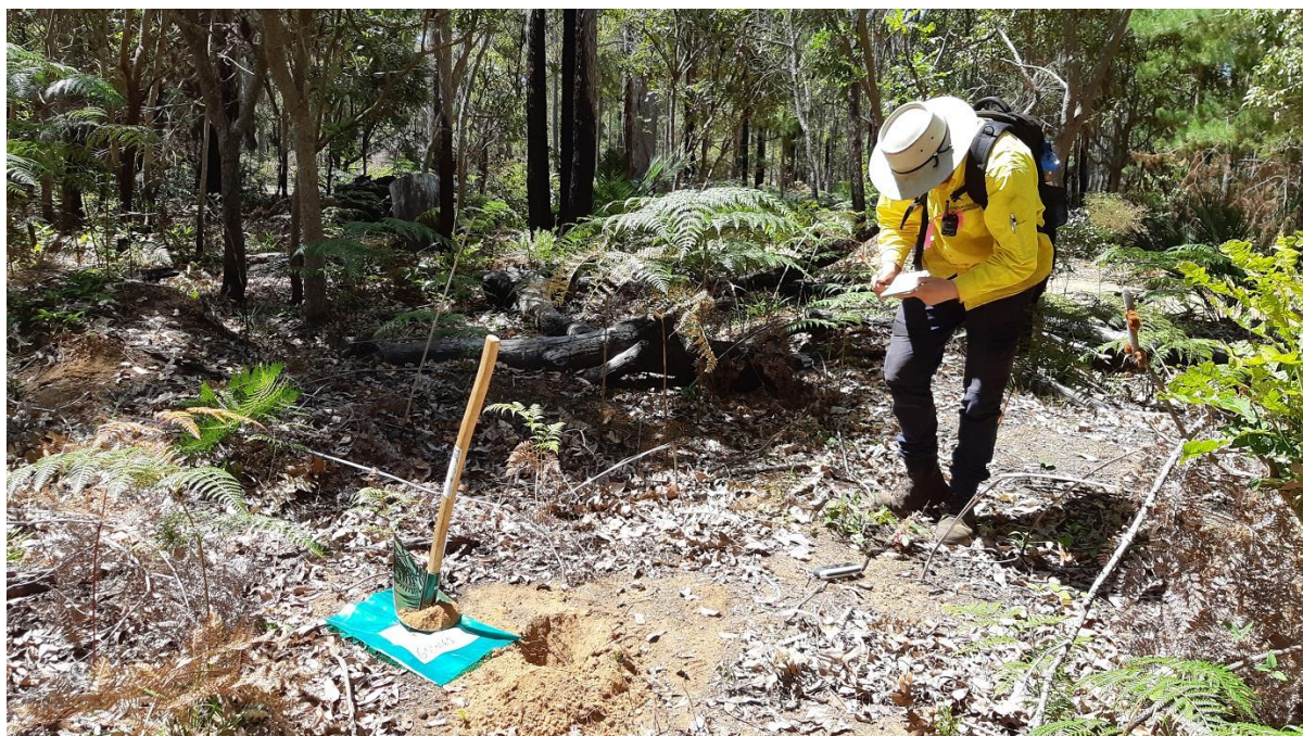
Figure 1 – Laterite sampling underway on LPI's Greenbushes tenement

Previous laterite sampling by LPI identified zones with significantly elevated geochemistry (Figure 1). This includes the Balingup East target, with strongly elevated arsenic in laterite (to >500 ppm) and elevated Sn, Cs, Bi, Nb, Rb and Sb along the Donnybrook-Bridgetown (DB) Shear Zone. This strong arsenic geochemistry identified by LPI defines a northern extension of the strong arsenic geochemistry identified by historical laterite geochemistry on the Greenbushes mine site ( Smith, et. al., 1987, Journal of Geochemical Exploration, 29, p251-265 ). LPI has also mapped pegmatites outcropping in this area.