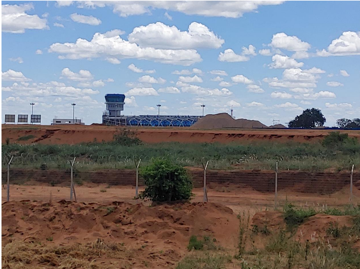
Figure 2. Nhacutse Airport (Under construction)