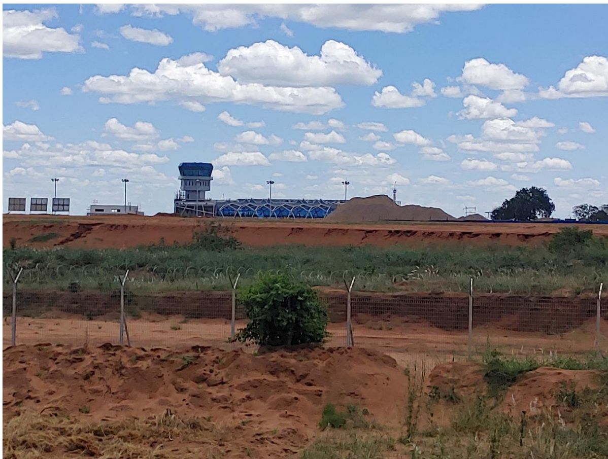
Figure 2. Nhacutse Airport (Under construction)