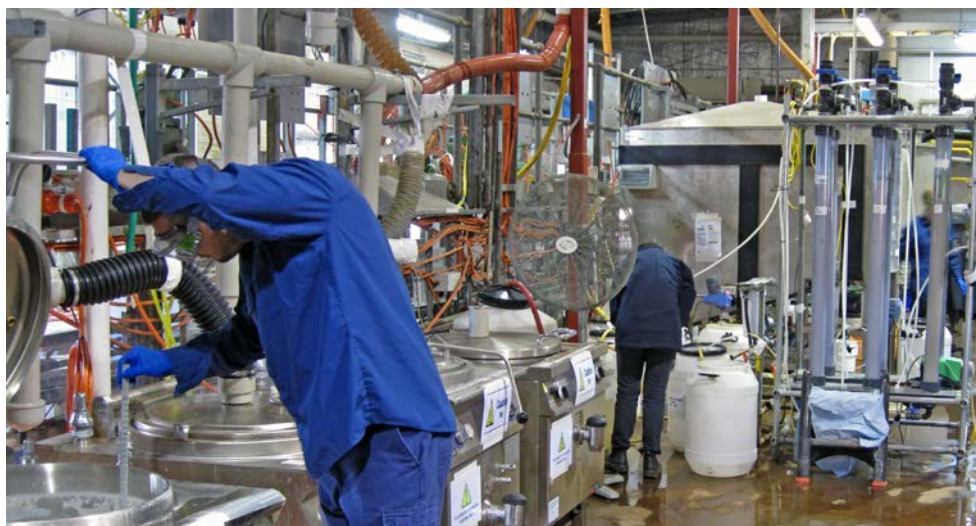
SiLeach® pilot plant operations at ANSTO

"Granting of the US SiLeach® patent is timely, given increased interest in the extraction of lithium from clays in north America ... and even more so now that LFP is the most rapidly expanding sector of the lithium-ion battery industry. The lithium and phosphorus required to manufacture LFP are both produced by SiLeach® as a single lithium chemical. We invite anyone with a lithium mica or clay deposit to reach out and see what we can offer; also, cathode producers interested in discussing a more direct route to LFP synthesis using our proprietary VSPC cathode powder production technology."