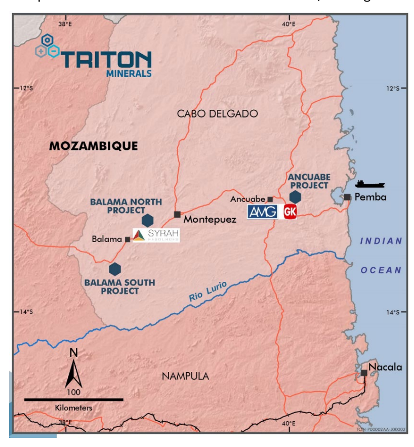
Figure 1. Location of TON's Graphite Portfolio

Ancuabe graphite is suitable for all markets and ideally positioned to take advantage of the forecast rapid growth in electric vehicle production. Anode producers are reporting increased orders and prices responded in December 2020 with a 6.2 percent increase in the Benchmark Price Index, the largest increase since May 2018.