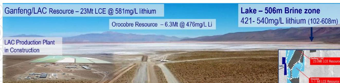
Figure 3. Location of Lake's Cauchari results in relation to the Lithium America's production project.

Lake holds mining leases over 45,000 hectares in two areas in Jujuy Province in NW Argentina, both 100% owned by Lake. Confirmation of multiple high-grade lithium brines over 506m interval (102m to 608m depth) at Lake's 100% owned Cauchari Lithium Brine Project was demonstrated in results returned in late August 2019. This drilling confirmed similar grades and lithium brines extending into Lake's properties from the adjoining Ganfeng/ Lithium Americas Cauchari project (NYSE:LAC), progressing to production in 2021 at 40,000tpa LCE.