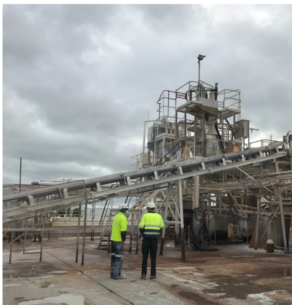
Figure 3: Pittong processing plant facilities