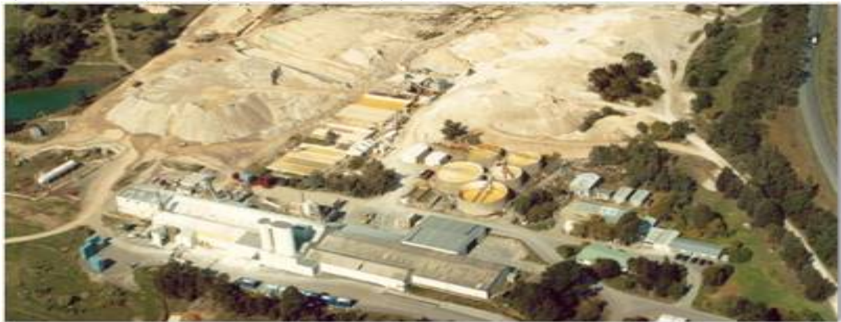
Figure 2: Aerial of Pittong processing plant facilities