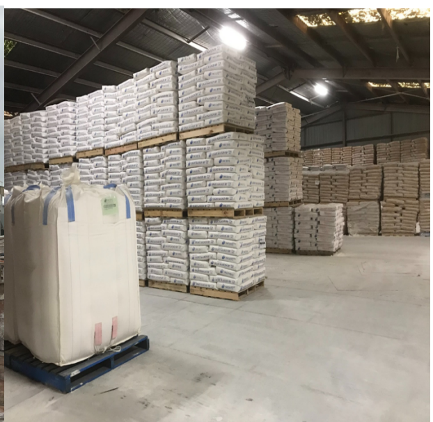
Figure 4: Finished kaolin products ready for dispatch