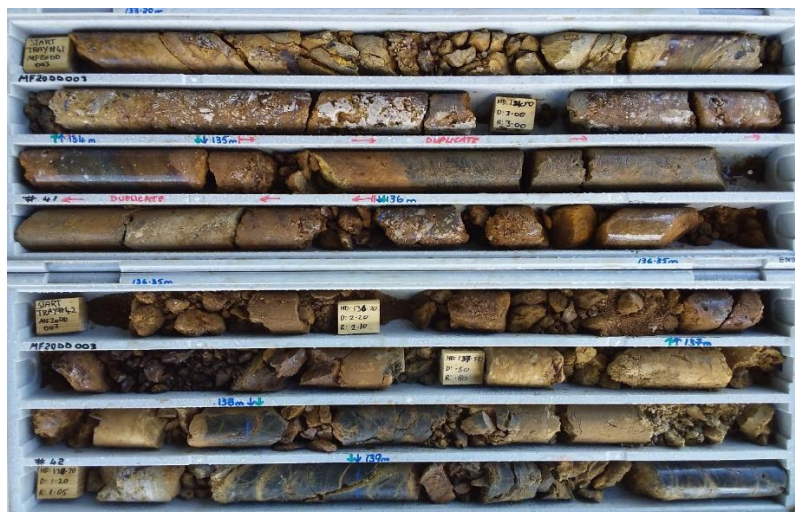
Photo 4. Section of mineralised zone in MF20DD003: 5 metres @ 11.24g/t Au from 133-138m incl. 3m @ 18.59g/t Au.