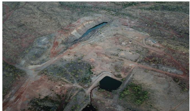
Photo 6. Mt Freda historical pit and evaporation cell.