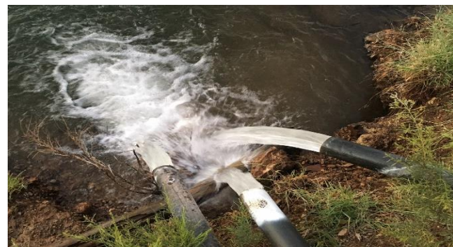
Photo 8. Transfer pump and bore pump discharge.