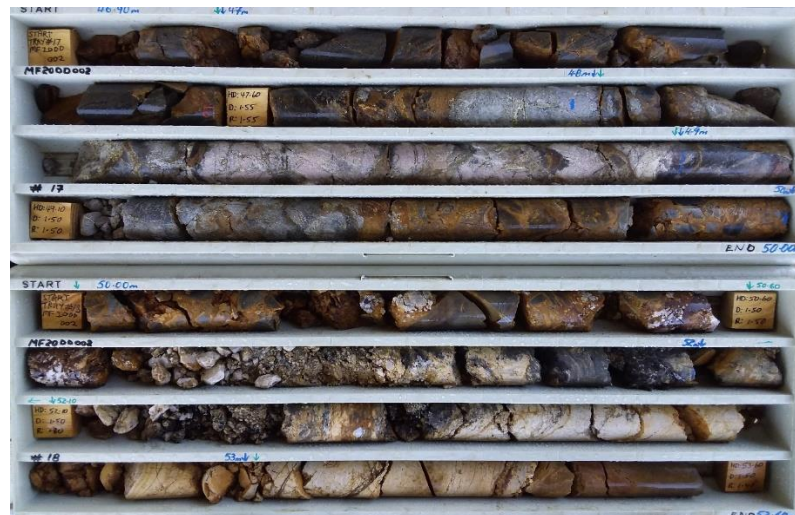
Photo 3. Section of mineralised zone in MF20DD002: 12m @ 3.54g/t Au from 43-55m incl. 4m @ 8.34g/t Au.