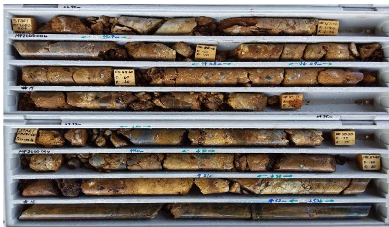
Photo 1. Section of mineralised zone in MF20DD004: 8 metres @ 5.93 g/t Au from 48-56m including 4m @ 11.44g/t Au.

MF20DD003: 5 metres @ 11.24g/t Au from 133-138m including 3m @ 18.59g/t Au.