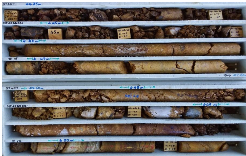
Photo 2. Section of mineralised zone in MF20DD001: 11m @ 3.6g/t Au from 41-52m incl. 2m @ 13.80g/t Au.