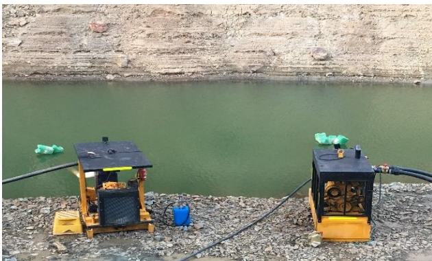
Photo 5. Pit dewatering pumps in action.

The Company can confirm that all the Diamond Core holes recommenced for the updated JORC Resource estimates are now complete and the 5 RC holes recommended are near completion. At the completion of the assays from the mineral laboratories, the results and the geological data will be forwarded to the Independent Geological Consultants to complete the updated JORC resource statement. The Company is pleased with the high-grade Gold intersections to date which were required to prove the continuity of high-grade gold and being grade consistent, between the wider gap holes, together with some twinned holes. The Company will advise shareholders when all the assays are received and notify accordingly as well as when the upgrade JORC is expected to be completed.