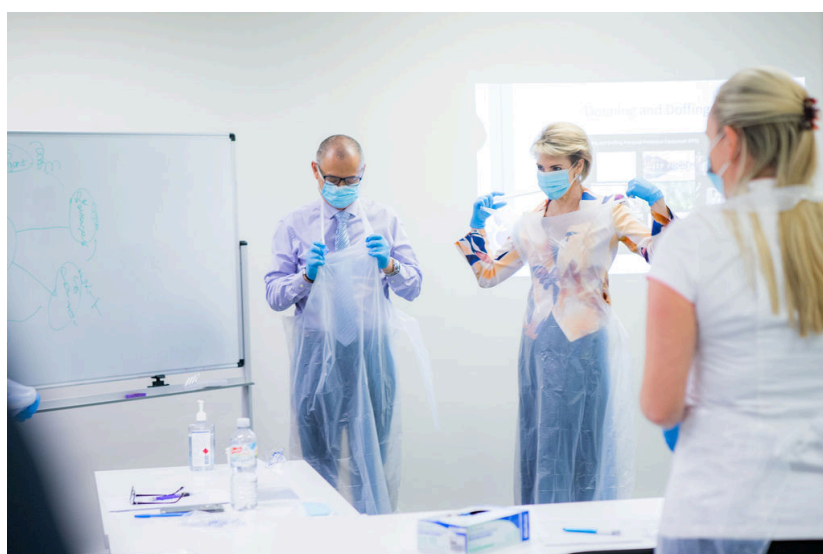
Images 1 & 2: Senator The Hon Michaelia Cash (Minister for Skills, Small and Family Business) at the first Infection Control Training course at the Sero Institute Osborne Park Individual Support Training Campus