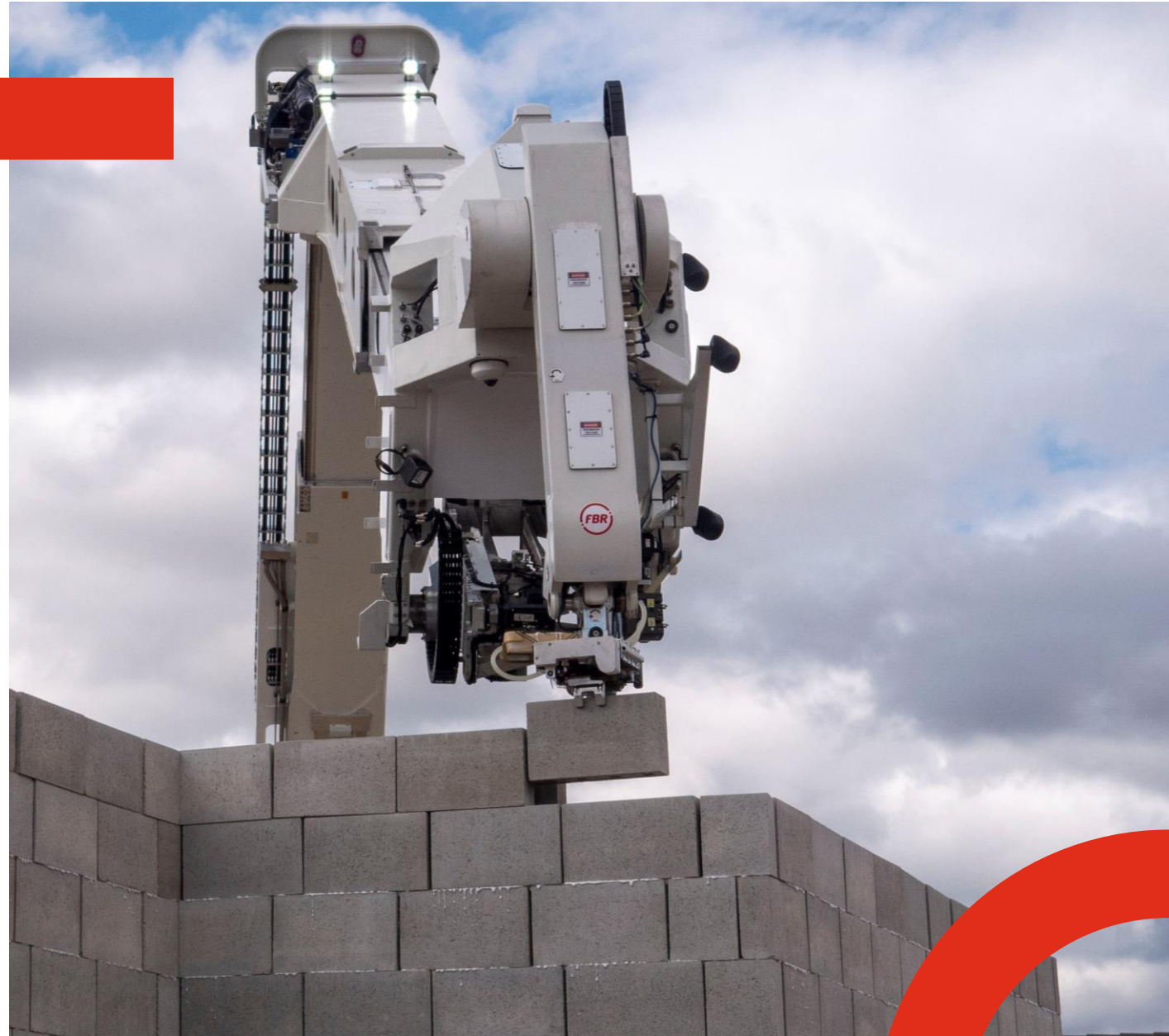
Hadrian X® completes its first house build in a residential development.