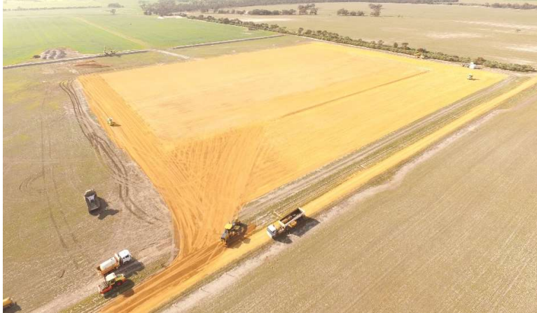
Figure 2: Wickepin Stage 1 earthworks in construction

The construction program has begun with the earthworks for the processing plant completed ready for the construction footings and concrete to begin. The long lead time processing plant elements have been ordered and are on track to be delivered to East Wickepin on schedule. The Stage 1 construction program will continue over the next 9 months with commissioning of the plant scheduled for the 3 rd quarter of 2021. The Company looks forward to providing regular updates to investors as the construction and commissioning program progress over the next 12 months.