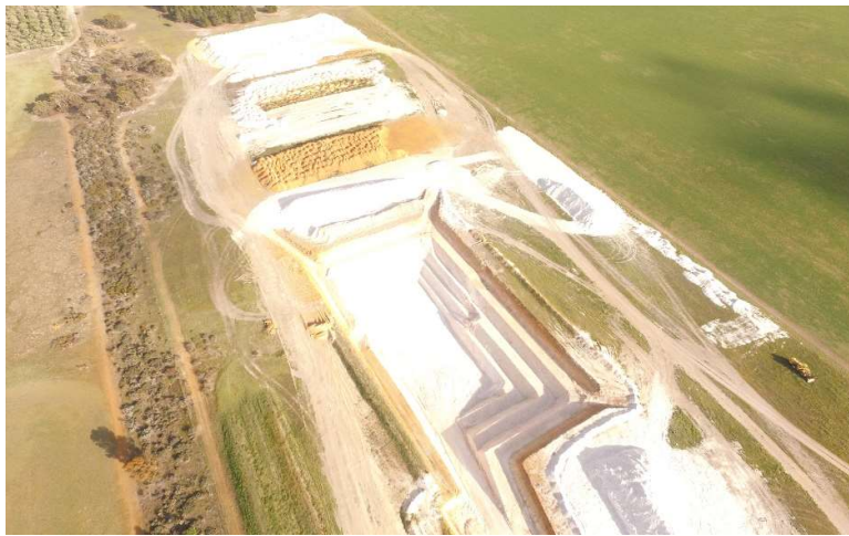
Figure 1: Aerial view of the Wickepin Kaolin Project Pit 2

"We wish to thank investors who have supported us in the Pre-IPO and IPO fundraisings, and we look forward to a long and prosperous relationship moving forwards as we develop the Wickepin Kaolin Project."