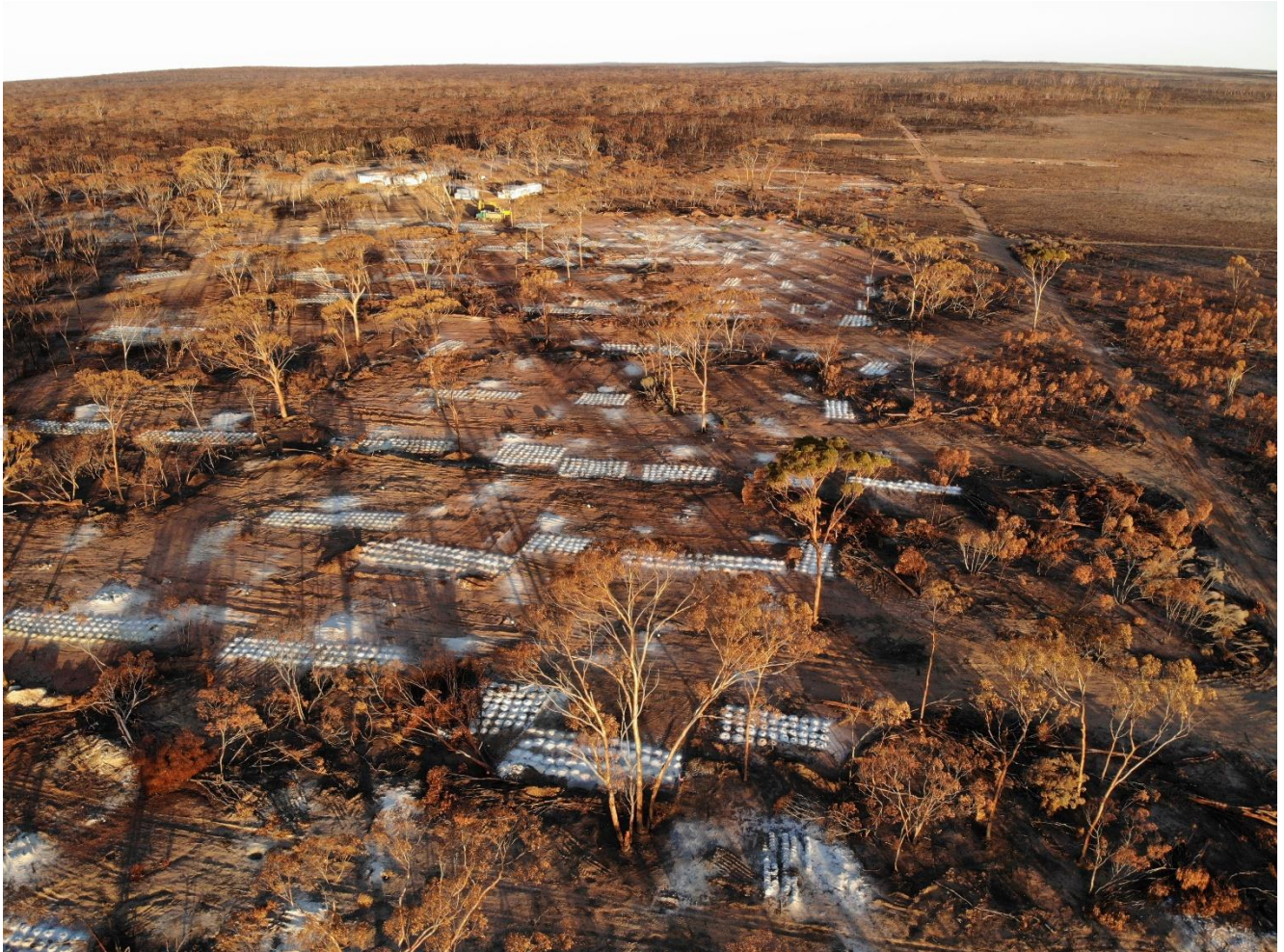
Figure 1a: Infill Drilling at Kat Gap

As per LR 5.23.2 the Company confirms in the subsequent public report that it is not aware of any new information or data that materially affects the information included in the relevant market announcement and, in the case of estimates of mineral resources that all material assumptions and technical parameters underpinning the estimates in the relevant market announcement continue to apply and have not materially changed.