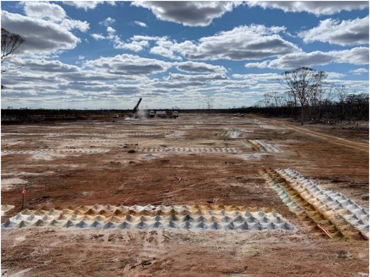
Figure 1b: Infill Drilling at Kat Gap