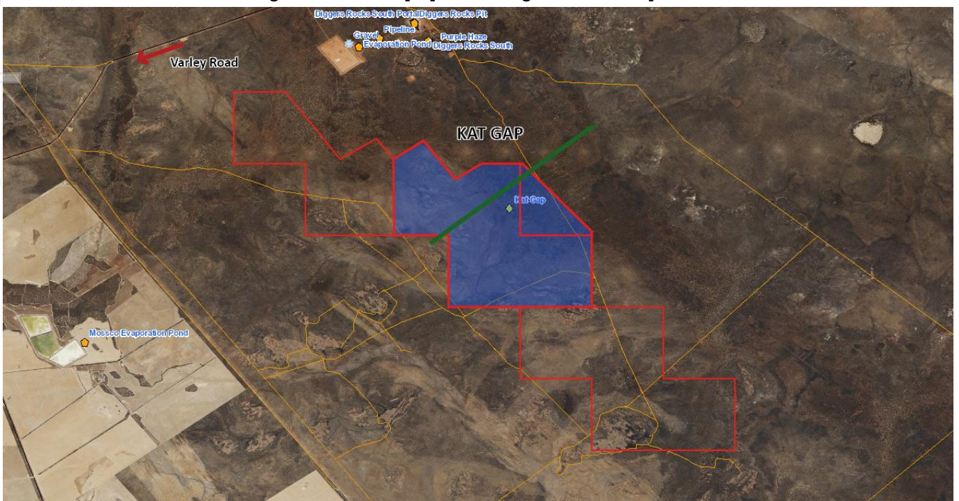
Figure 2: Outline of proposed Mining Lease at Kat Gap - below