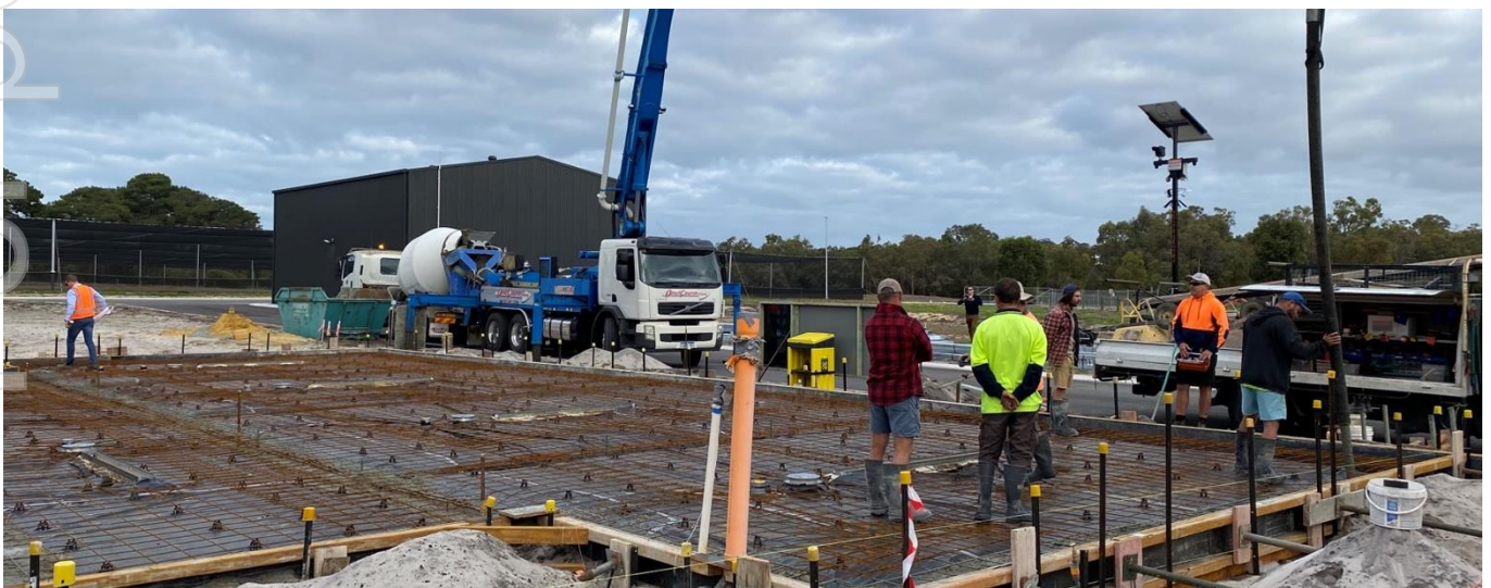
Photographs of commencement of slab pour for ClearVue greenhouse at Murdoch.