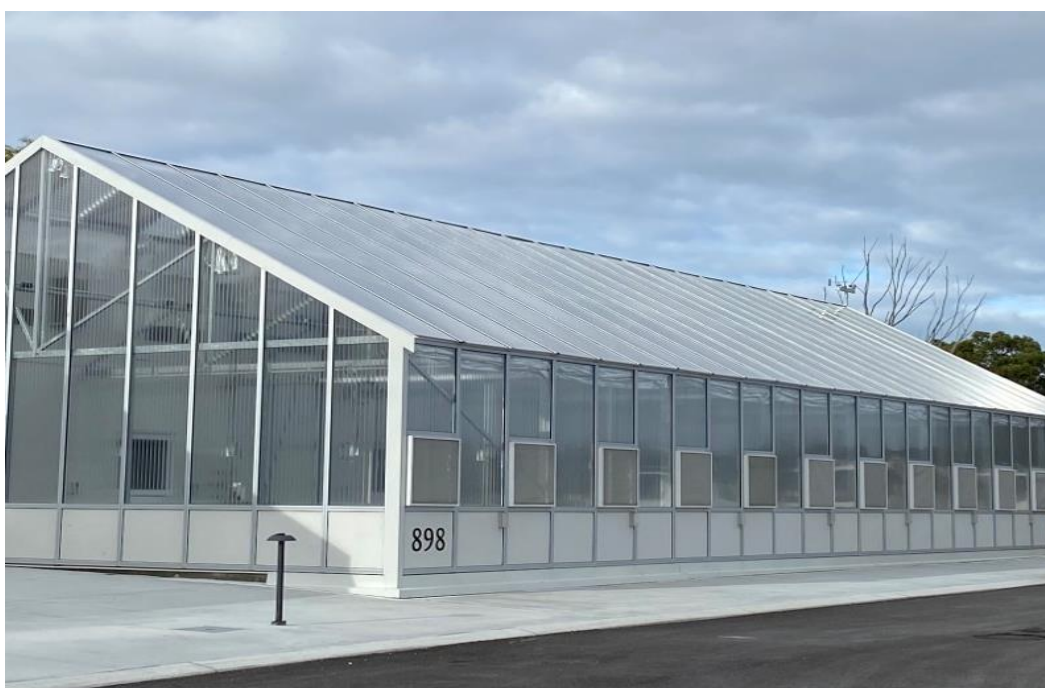
Photograph of adjacent PC1 greenhouse.

The remaining three sections of the greenhouse comprise three different iterations of the ClearVue PV solar glazing technology. The second section being the currently available product, the third and fourth being variants of the currently available product that the Company anticipates may perform better in the greenhousing application.