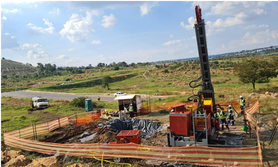
Image 1 – Drilling team commencing the 1 st of a 23-borehole diamond core drilling campaign

A total of 23 boreholes are planned for 2,500m of drilling. The drilling program is focussed on the upper 300m of the future mine and designed to improve mineral resource confidence levels. The ongoing drilling campaign will also improve the confidence levels of the areas targeted for early mining and, if successful, would allow WWI to declare reserves on completion of the BFS.