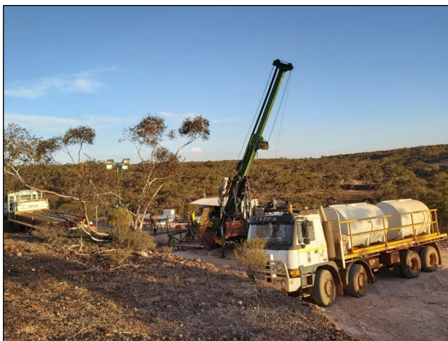
Photo 2 – Diamond drilling underway at the Horn Prospect of the Leinster Nickel Project