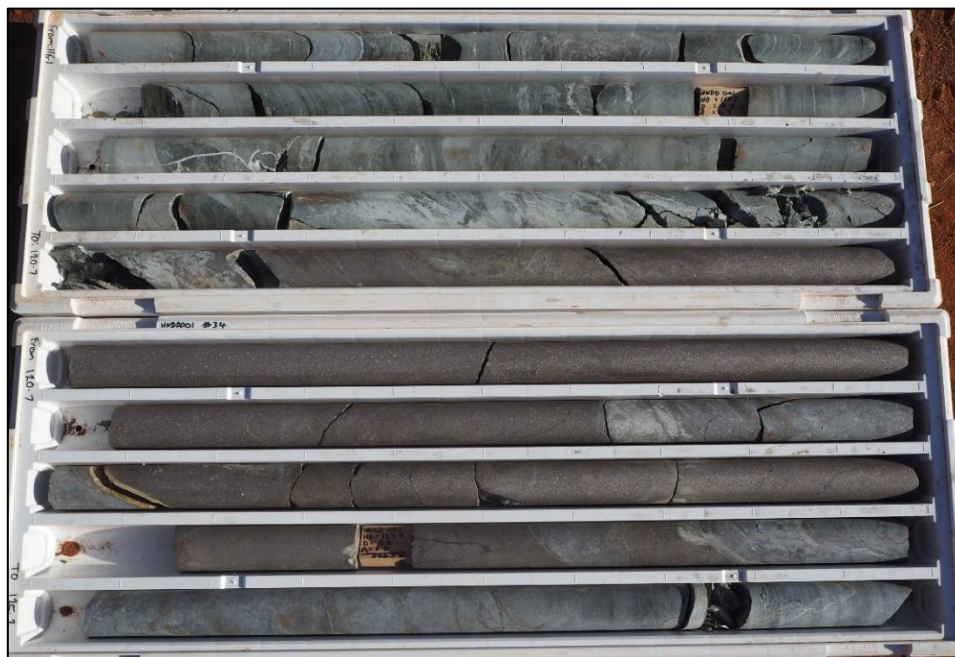
Photo 1 – HNDD001 Trays 33 & 34 (116.1m-125.2m): semi-massive to massive nickel sulphide (Po-Pn-Cpy) mineralisation from 120.0 – 125.0m down-hole

At the Valdez Prospect , a single diamond drill-hole was completed to a depth of 400m 1 . The hole was drilled to target a strong DHEM conductor defined by deep RC drilling in October. A DHEM survey of the completed hole is currently underway, and logging and sampling of the drill core is pending; however, no massive nickel sulphides were observed in the core. The Company will use the results from the logging and sampling of this drill hole along with the pending assay results from the RC drill-holes to update the litho-geochemical model of Valdez, and this will be utilized together with the results from the current DHEM survey to generate further drill targets at the Valdez Prospect.