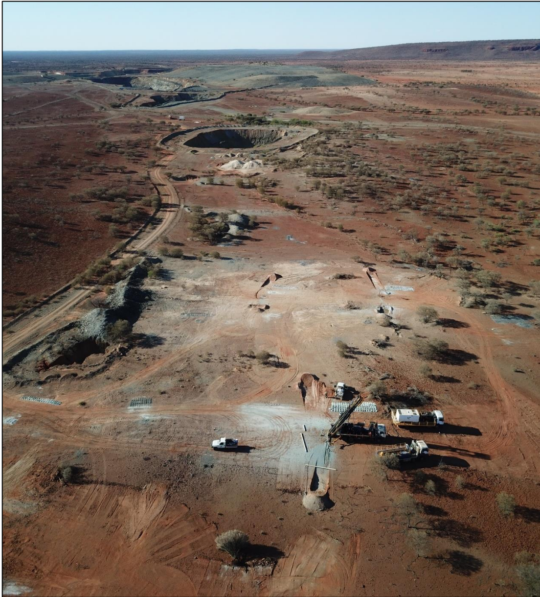
Figure 3 – View looking north of drilling at Tumblegum South with Gabanintha open pits in background