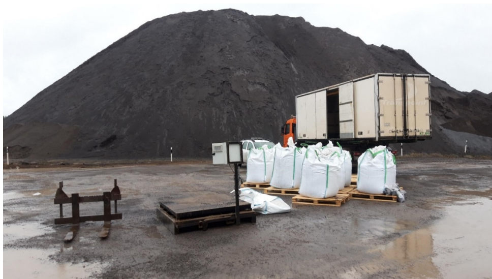
Figure 3 - Image of Bulk Samples from Raahe prior to loading in sea containers bound for Fremantle