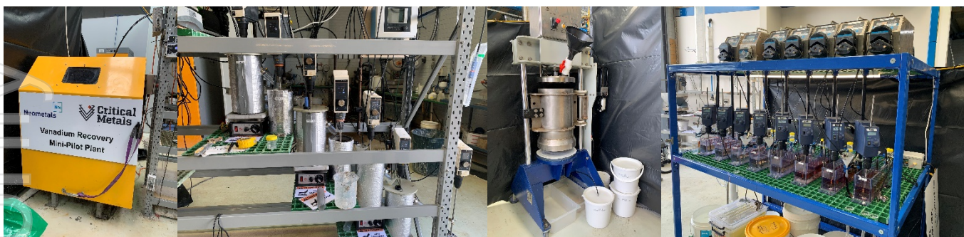
Figure 1 - Selected images of the mini-pilot plant including (from left to right): the rod mill, the integrated leach and regrind circuit, the pressure filter, and the solvent extraction circuit