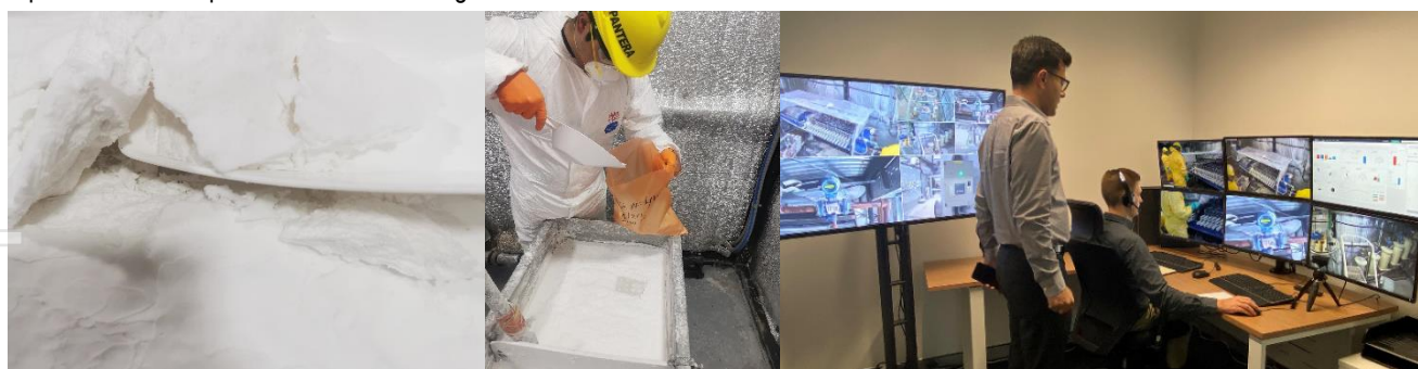
Figure 2: Sal de Vida brine produces technical grade lithium carbonate (left and centre) and piloting is monitored from Perth’s operations centre (right)

The pilot plant was successfully commissioned in the previous quarter and all stages, including brine distribution, ponds, liming, softening and carbonation are operational and effective. The first full run from evaporated brine through all process stages to final product has been completed. Assaying of the final product has shown lithium carbonate purity of 99.5-99.7% combined with low levels of impurities. This meets technical grade specifications and other outcomes to date are also in line with targeted processing parameters and continue to validate the process design assumptions. Ongoing piloting activities will focus on increasing continuous operating hours and producing representative samples for customer testing.