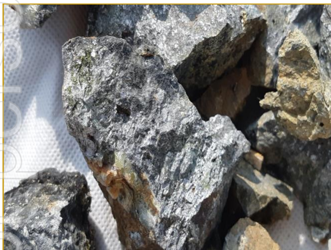
Massive arsenopyrite hosted in stockwork quartz veins