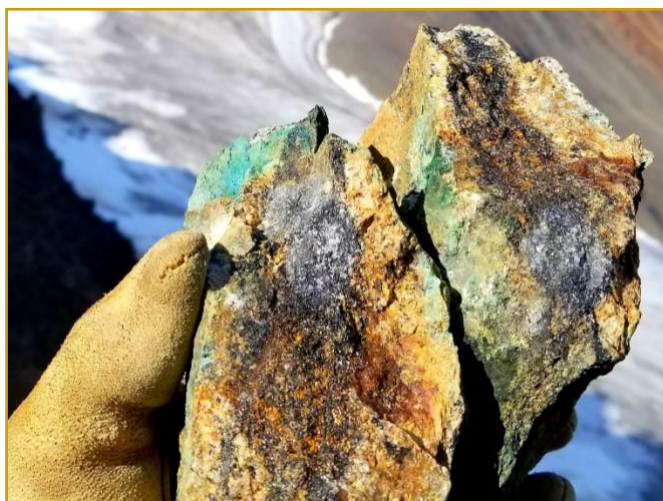
Arsenopyrite hosted in quartz-tourmaline vein