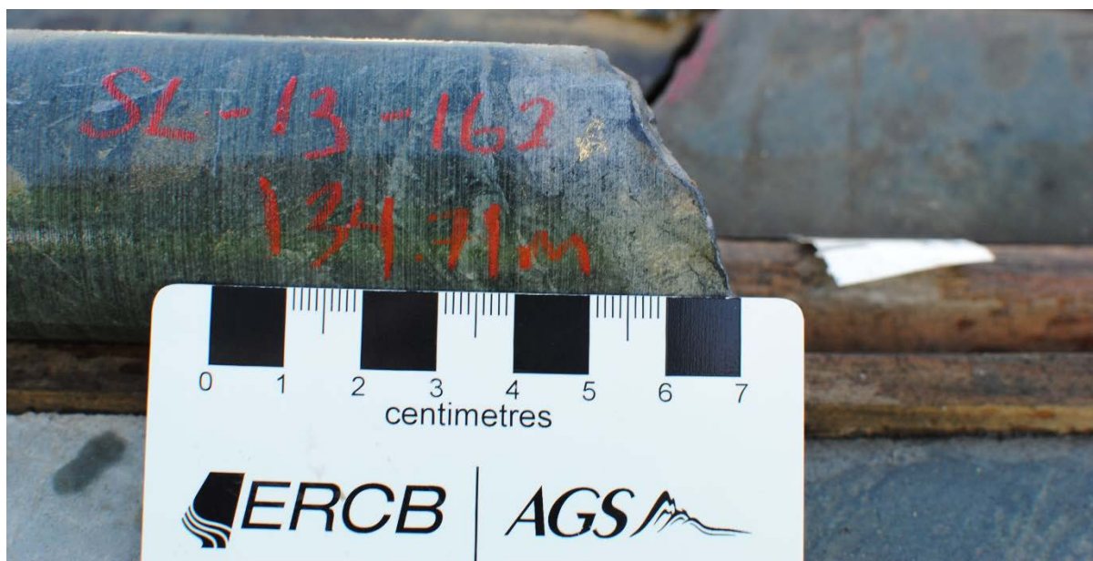
FIGURE 1: SL-13-162- VISIBLE GOLD IN DRILL CORE