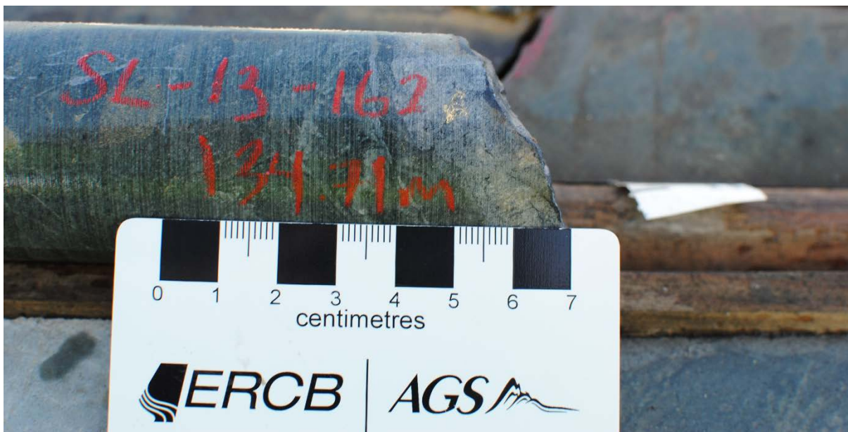
FIGURE 1: SL-13-162- VISIBLE GOLD IN DRILL CORE