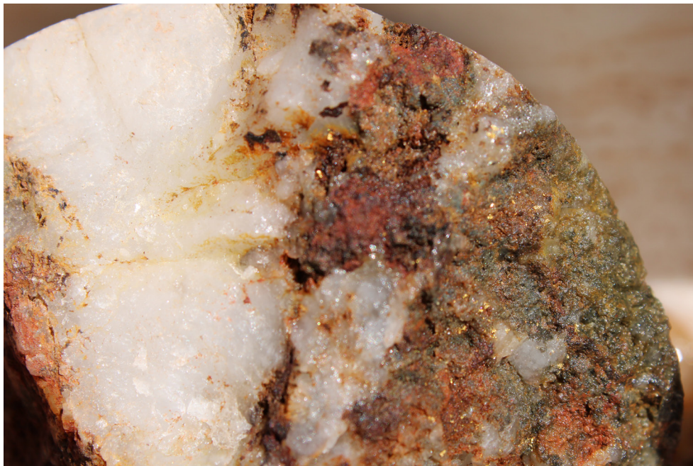
HQ drill core from SFDD20_005 at Sailfish showing abundant visible gold.