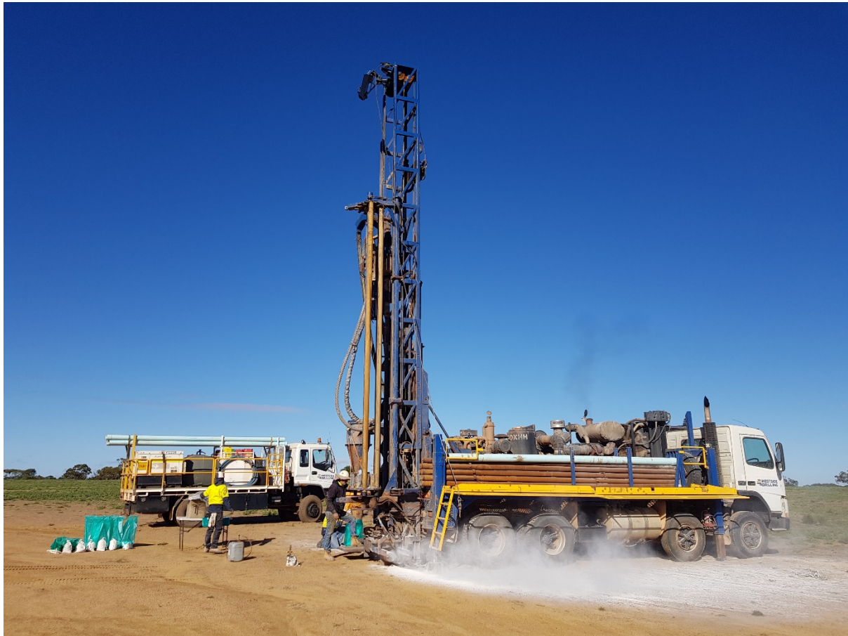
Figure 1: Drilling bright white kaolin at Tampu Kaolin Project, Beacon WA (photo taken 8 th May 2021)

Corella Resources Ltd (ASX:CR9) ("Corella" or the "Company") is pleased to advise that resource and metallurgical drilling has commenced at the company's 100% owned flagship Tampu kaolin project, located near Beacon in Western Australia. The drill program will total ~2,000m and consist of 80 to 120 RC/AC drill holes, to an average depth of ~20m to a drill spacing of 80 x 80m in select locations.