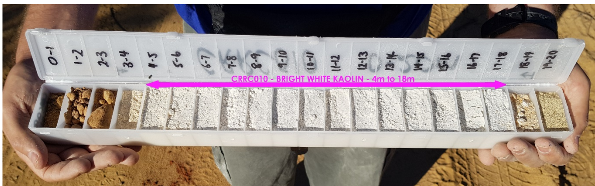
Figure 2: Drillhole CRRC010 with bright white kaolin from 4m to 18m (14m intercept)

The 100% owned Tampu Kaolin Project is located 275km northeast of Perth, Western Australia. The two granted exploration licences at Tampu cover an area in excess of 81km 2 near the town and rail siding of Beacon. The project has bitumen road access, mobile network coverage and unused infrastructure located less than 3km from the project site.