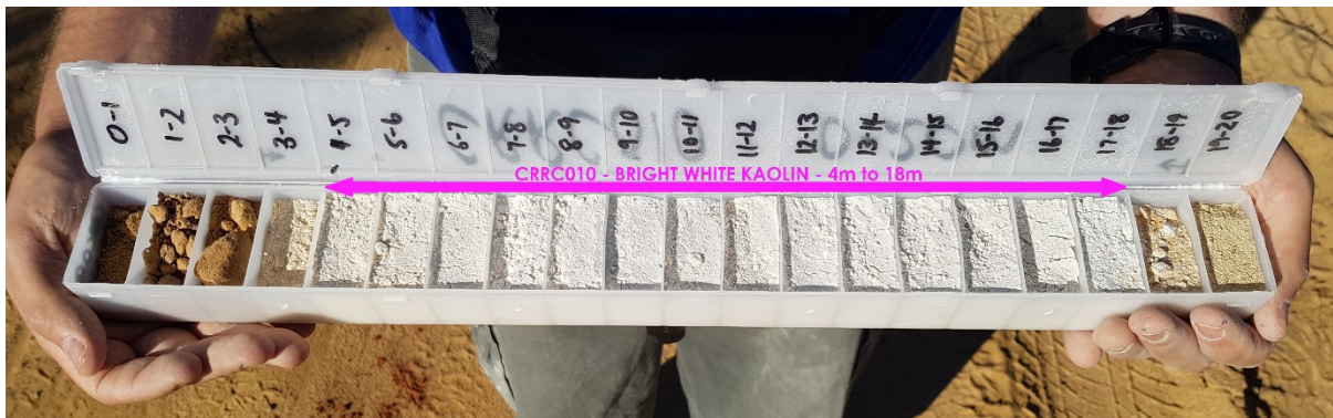
Figure 2: Drillhole CRRC010 with bright white kaolin from 4m to 18m (14m intercept)

The 100% owned Tampu Kaolin Project is located 275km northeast of Perth, Western Australia. The two granted exploration licences at Tampu cover an area in excess of 81km 2 near the town and rail siding of Beacon. The project has bitumen road access, mobile network coverage and unused infrastructure located less than 3km from the project site.