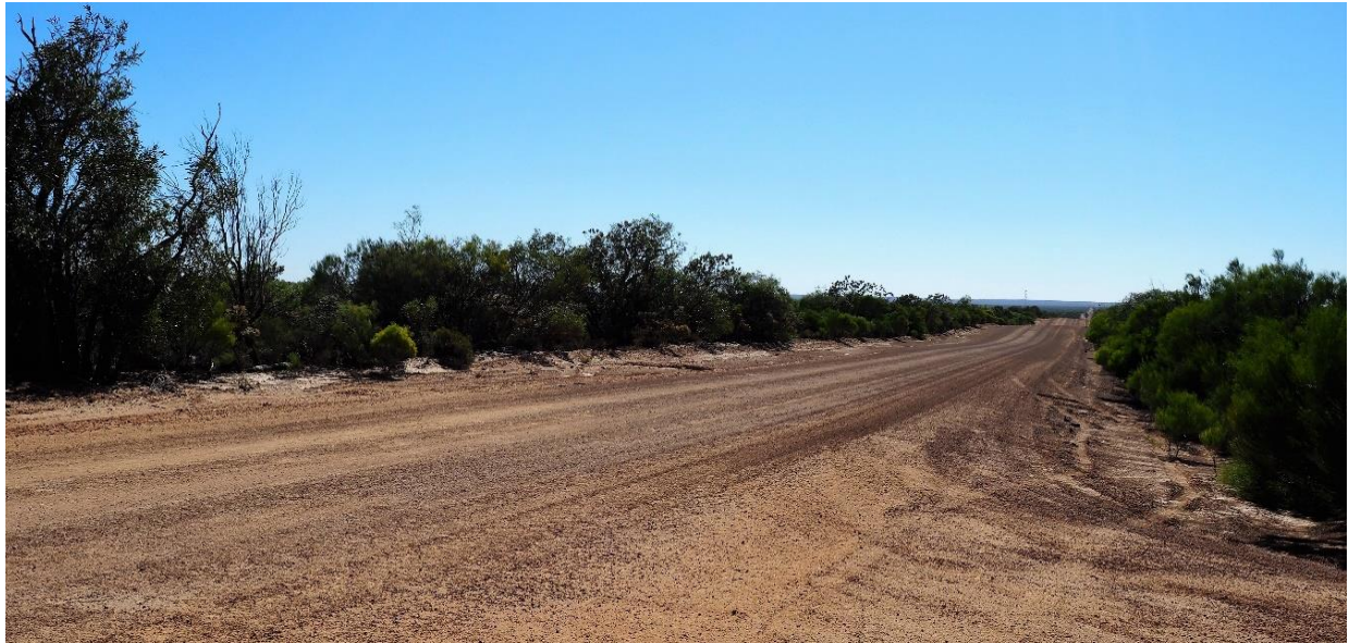
Mt Adams Road which Intersects the Beharra Tenement

Perpetual's flagship asset, the Beharra Project is located 300km north of Perth and is 96km south of the port town of Geraldton in Western Australia. Access to the Project from Geraldton (to the north) and Perth (to the South) is via the sealed Brand Highway, thence the Mt Adams unsealed road providing access to the centre of the tenure.