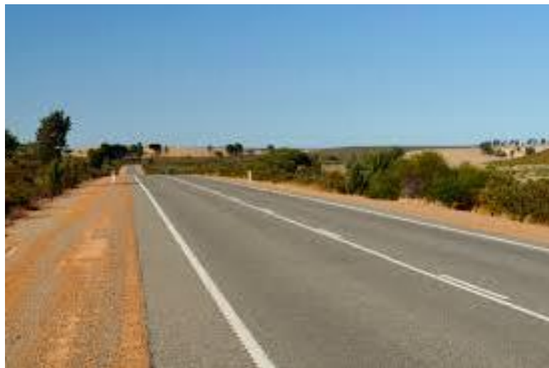
Brand Highway Proximal to Beharra

The port of Geraldton is utilised as a bulk material handling facility and is currently utilised for the export of bulk materials, minerals and concentrates. Grains, copper concentrates, zinc concentrates, nickel concentrates, mineral sands, talc, and iron ore are currently being exported from the port. Extensive heavy mineral sands mining occurs to the south of the Project area, lime sands mining to the west and natural gas production to the south of the Project.