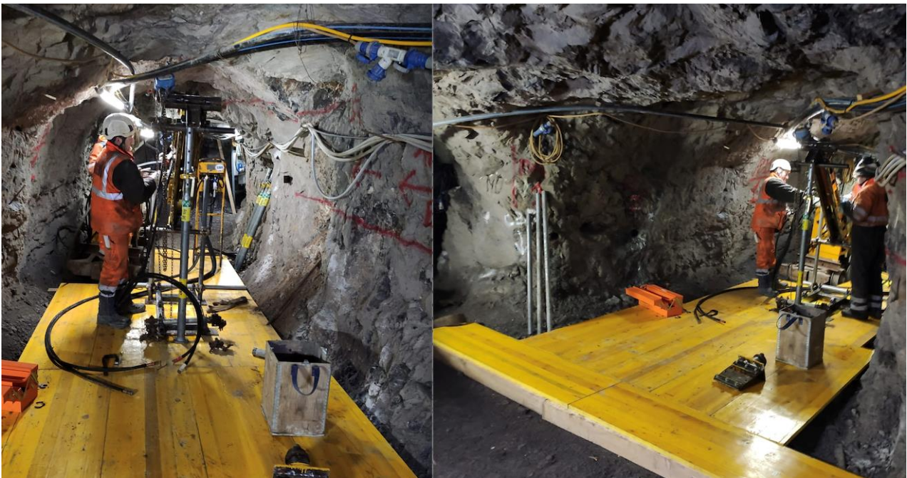
Figure 1: Gorno's second Diamec 230 drill rig underground at Ponente, where drilling is now underway

A drilling campaign has been planned at Ponente which targets the well understood Metallifero Formation from the existing underground access. Initially, 25 short diamond drill holes are required to provide maximum information from just a 1000m campaign. Follow-on drilling will be planned on extensional targets once discovered. This highly efficient campaign is possible because the existing access was historically developed for the purposes of exploration and to be close to the known and expected mineralisation. However, full exploration and exploitation were never carried out due to the premature closure of the mine. Initial results from this new campaign are expected by the end of March.